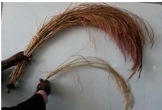
Figure 5. Comparison of tef panicles growing from a single plant: the top panicle was grown with TIRR methods, and the bottom panicle with standard broadcasting methods.

ATA reported that in 2014/2015, 2.2 million farmers were using TIRR methods, one-third of the total number of tef farmers in Ethiopia, on 1.1 million ha. The average TIRR yields of 2.8 tonnes/ha were 75% higher than produced with traditional methods,