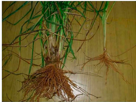
Figure 2. Comparison of the root systems of finger millet plants grown in Jharkhand state of India; SFMI methods on left, and conventional methods on right.

plants which are cultivated with SRI practices. These results were, however, unfortunately never published (Figure 3).