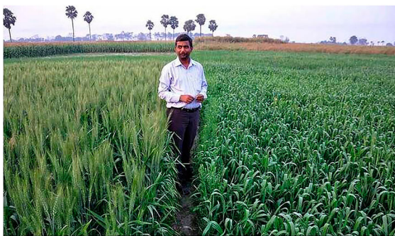
Figure 4. Adjacent wheat fields planted at the same time in Chandrapura village, Khagaria district, Bihar state, India, in 2012. The SWI wheat field on left matured earlier than the traditionally-managed field on right. SWI crop panicles had already emerged while the crop grown with standard methods was still in its vegetative stage.

guidance made further increases in yield, averaging 4.6 tonnes/ha instead of 2 tonnes/ha (PRADAN, 2012a). Beneficial crop responses to the new methods were easily seen (Figure 4). The Jeevika programme reported that average SWI yield increases in 2012 were 72%, with households' net income/ha from wheat production raised by 86% under SWI (Behera et al., 2013). By 2016, an estimated 500,000 farmers were using SWI methods in Bihar covering about 300,000 ha, with yields of 4–5 tonnes/ha representing an average increase of 60–80%.