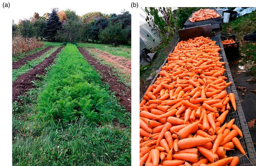
Figure 7. SCI carrot bed, on left, and harvest, on right, at Teltane Farm, Monroe, Maine, USA, 2014 (Source: Fulford, 2014).

broadcasted square metre of land. This is a yield equivalent to 3 tonnes/ha.