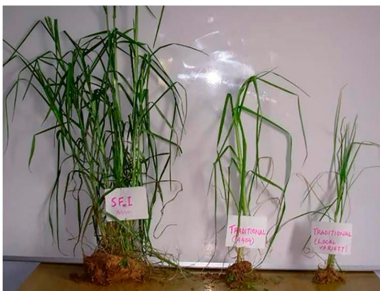
Figure 1. Finger millet plants grown with different methods in Jharkhand state of India, 2006 season. On left is a plant of improved variety (A404) grown with adapted SRI methods, including transplanting of young seedlings; in the centre is a plant of the same improved variety grown with farmers' usual broadcasting methods; on right is a local variety grown with these same traditional broadcasting methods.

Researchers at the state agricultural university in Andhra Pradesh (ANGRAU) had previously evaluated the effect that transplanting finger millet seedlings at a young age had on root growth. Two improved varieties were transplanted as seedlings when 10, 15, and 21 days old, respectively, and their roots were compared at 60 days after transplanting. Their results showed that finger millet plants have a root-growth response to the transplanting of young seedlings that parallels what has been observed with rice