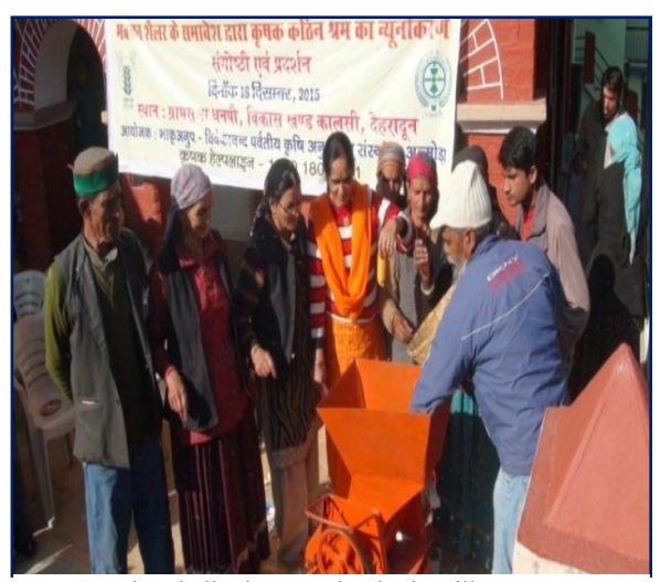
Plate 4 Maize sheller intervention in the village

It was observed that average man hours required to shell one quintal of maize manually were 8 man hours which were reduced to 0.5 man hours per quintal by using maize sheller (Table 5). It can be concluded that about 7.5 man hours can be saved in shelling a quintal of maize with the maize sheller introduced in the area.