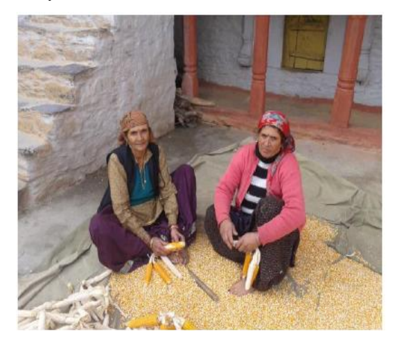
Plate 3 Jaunsari women shelling maize manually

the amount of force, repetition and duration of exposure (Geronilla et al. , 2003). It calls for dire need for replacing the activity.