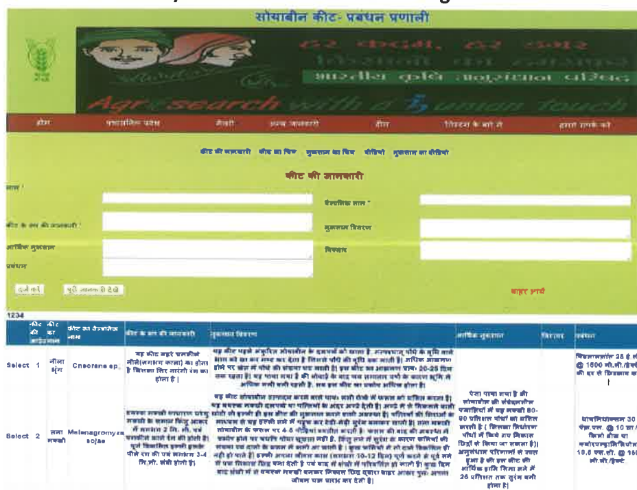
Fig 2 Web-page showing the data entry form of soybean insect data management system