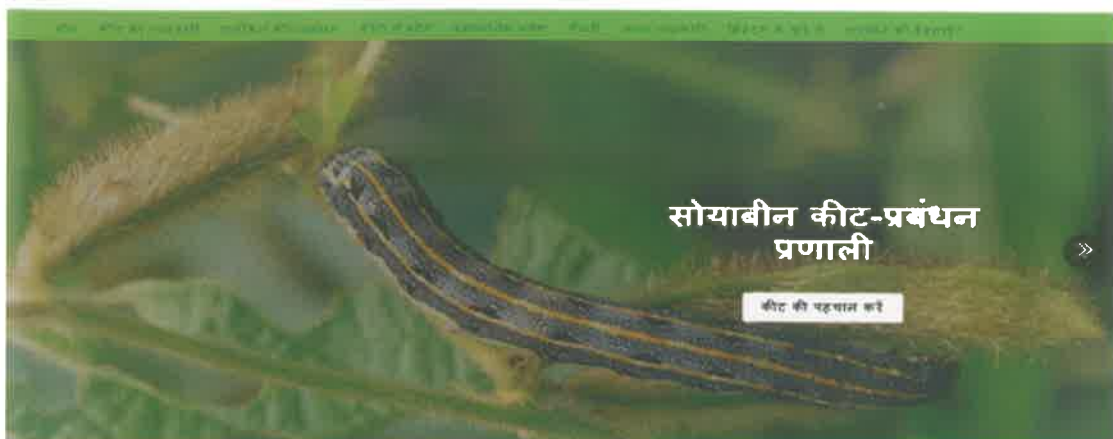
Fig 1 The main web-page of the Decision Support System for Identification of Soybean Insects and their Management