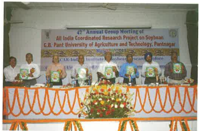
47 th AICRP workshop at G.B. Pant Agriculture University