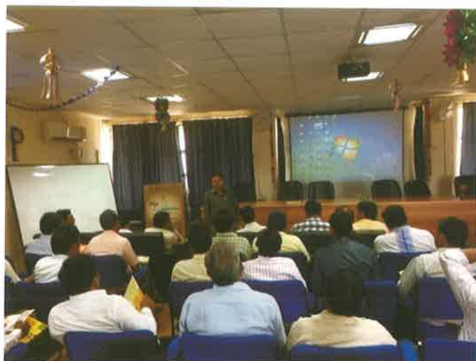
Training program organised at ICAR-IISR Indore