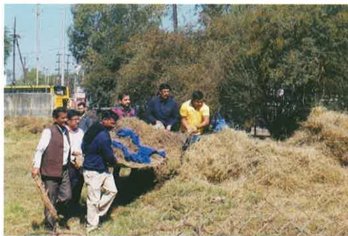
Swachhata Abhiyan carried out at IISR campus

The institute is regularly organizing cleanliness drives on last Saturday of every month and taking up the activities for cleanliness and maintenance of Office Building, Laboratories, Canteen, Farm section Buildings, Residential Campus and various roads located in IISR campus. Under the programme, various activities as outlined in the Annual as well as Five Year Plan are being conducted especially organization of Swachhata Pakhwara , public rally, cleanliness programme at public/tourist places, digitization and weeding out old office records, use of bio-degradable waste for compost making etc.