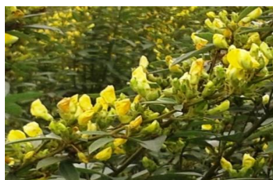
Field view of an NDT cleisto line ‘DBGA 5’ at full bloom stage

The natural out crossing is a major source of varietal contamination, posing problems in the maintenance of varietal purity in pigeonpea. In station trials conducted during