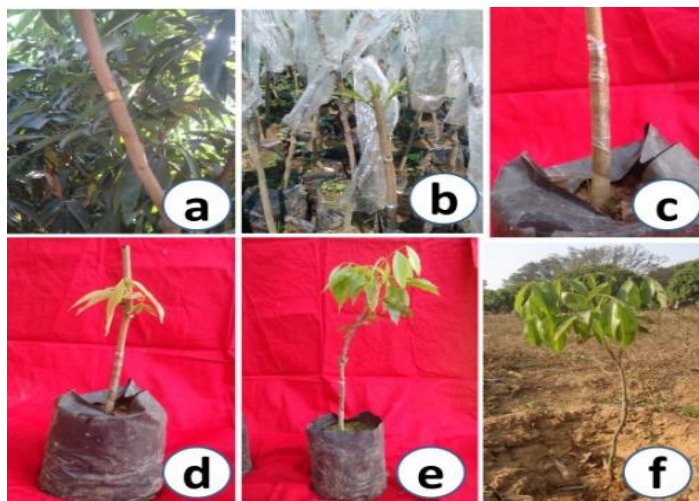
Different stages of wedge grafting in litchi cv. Shahi (a) Girdled branch in scion mother tree (b) Bud sprouting (c) Scion Union (d) Immature graft (e) Mature grafted plant (f) Grafted plant in the field

An experiment was undertaken to standardize the optimum time of grafting in litchi under Jharkhand conditions. The branches were girdled (removing of 3 mm ring from branches of 40-50 mm girth) one month before the collection of scion sticks for grafting. Defoliation was performed 7 days before the collection of scion sticks. Wedge grafting was performed under shade net. The graft success rate and vegetative growth were markedly improved as a result of girdling and defoliation. More than 50% success rate was observed for the grafting performed during June, July and August. The highest graft success rate (70%) was recorded during July indicating that July was the most favourable month to undertake grafting in Litchi.