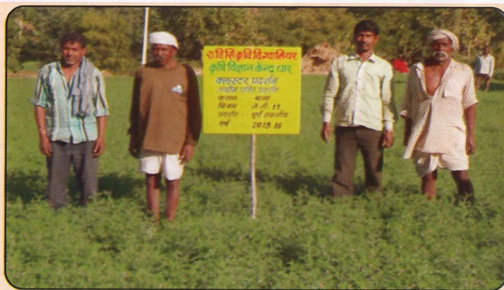
FLD Crop of Chickpea variety JG-63

This scheme is aimed for 'Enhancing Pulses Production for Food, Nutritional Security and livelihoods of Tribal Community through Demonstration and Training'. TSP is operational in 10 KVKs located in the tribal region of the M.P. and Chhattisgarh. 1100 demonstrations were conducted in different pulse crops in an area of 440 ha with Chickpea (JG-11, JG-16, JG-130, JG-63), Field pea (Shubhra, Vikas, Paras, Prakash) Lentil (JL-3). The highest productivity were recorded in Chickpea, Field Pea and Lentil as 1500, 1400, 1500 kg/ha. under demonstrated plots.