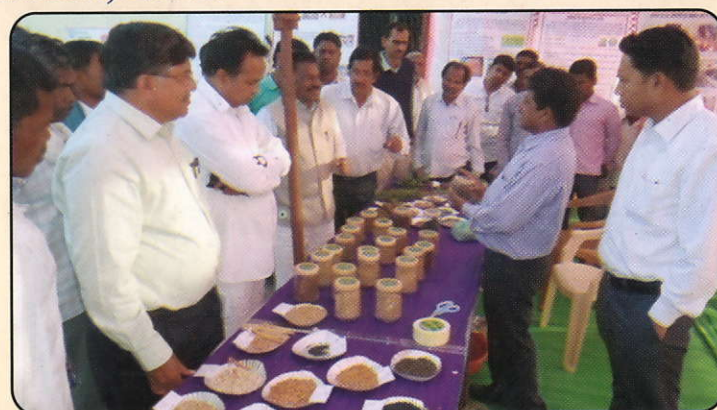
Exhibition stall KVK, Kanker

During January to March, 2016, 36 KVK level and one Zonal Level programmes have been organized for creation of awareness among the farmer's and other stake holders about the provision of Protection of Plant Varieties & Farmer's Right Act. During 2015-16 financial year, 44 KVK level and one Zonal level programme have been organized.