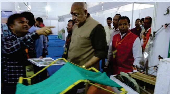
Sh. Giriraj Singh, Hon'ble Union Minister for State at KVK Stall