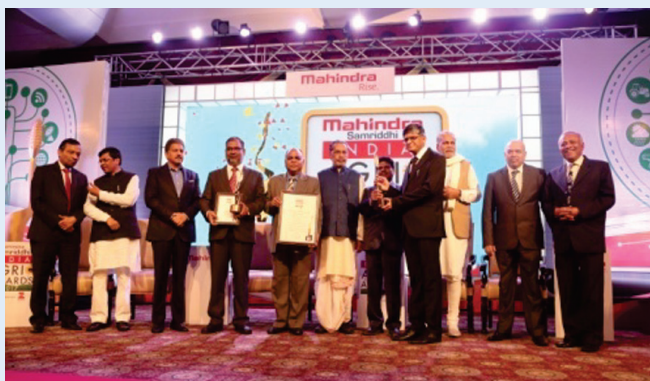
Mahindra Samridhi India Agri Award 2017 and Pandit Deen Dayal Upadhyay Krishi Vigyan Protshahan Puraskar (National) 2015-16 to KVK Kanker