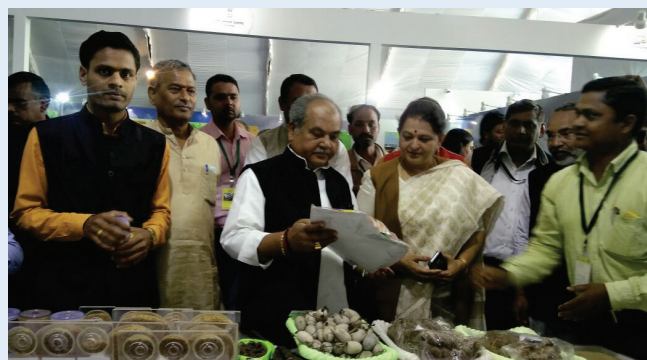
Sh. Narendra Singh Tomar, Hon'ble Minister for Rural Development