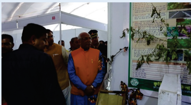
Hon'ble Governor of Haryana Sh. Kaptan Singh Solanki at KVK stall