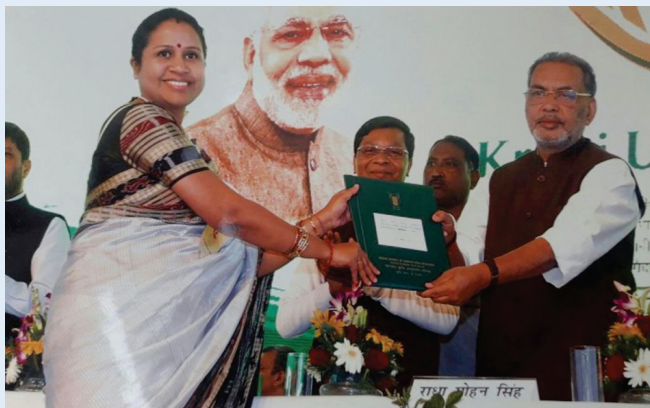
Pandit Deendayal Upadhaya Rashtriya Krishi Protshana Puraskar, KVK Mayutbhanj-I