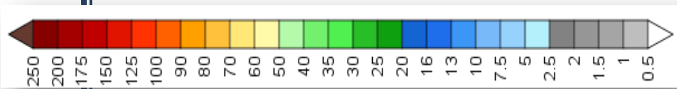
Figure: 2. Precipitation forecast for 03 to 10 June 2019.