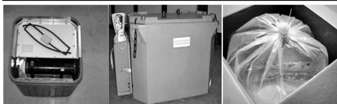
Closed transportation System