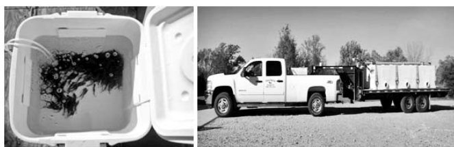
Open transportation System