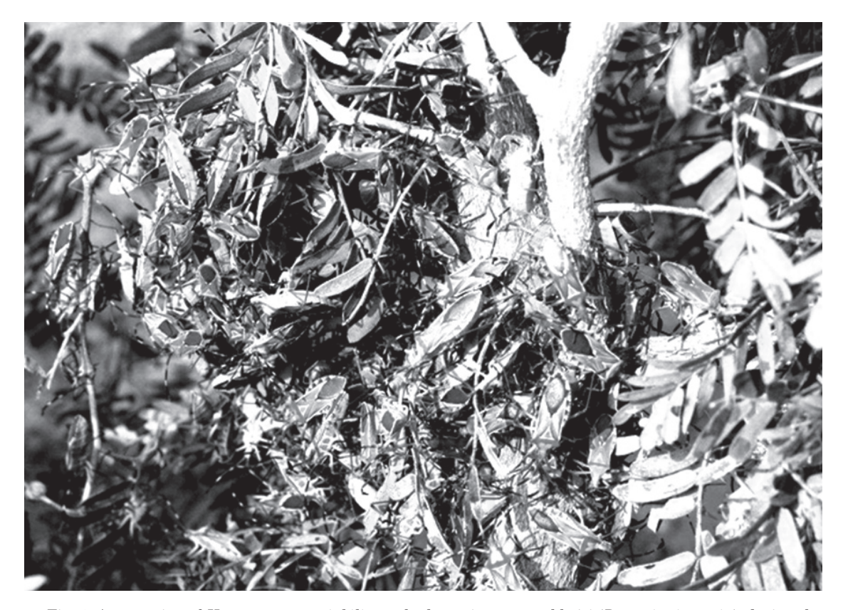
Fig. 1. Aggregation of Homoeocerus variabilis on the leguminous tree, khejri ( Prosopis cineraria ), during the winter season at the Central Institute for Arid Horticulture, ICAR, Bikaner, India.

with un-infested plants) were recorded from Aug 2010 to Jul 2011. The sampling was done by visual observation and manual counting. Average incidence was calculated as the percent of whole trees infested with H. variabilis . Average num-