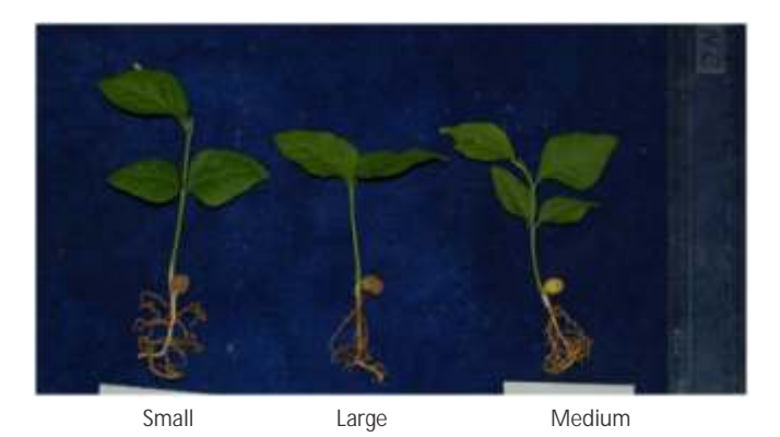
Table 2: Growth parameters of Bael (Aegle marmelos L.) in Seedling stage

Fig. 2: Difference in Number of leaves of three size class of Bael ( Aegle marmelos L.).