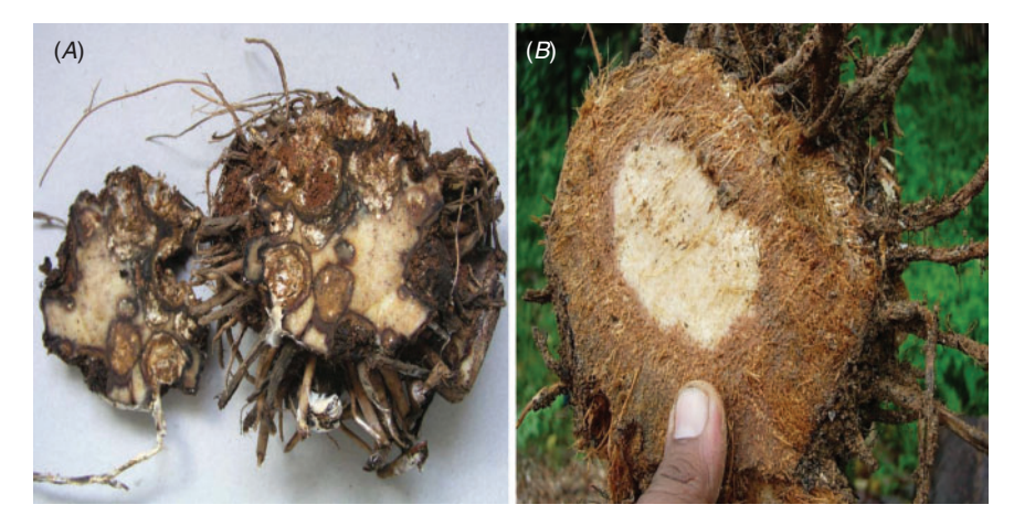
Fig. 2. Symptoms of corm rot disease in the corm. ( A ) Rotting of corm, in patches filled with mycelial growth of the fungus. ( B ) The infection of the fungus leads to conversion of corm tissues into fibrous material with mycelial growth.

Corm rot disease in banana **Australasian Plant Disease Notes** Australasian Plant Disease Notes**