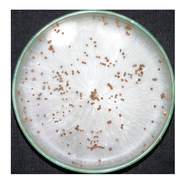
Fig. 4. Colony of Sclerotium rolfsii with brown sclerotia, after 7 days growth on potato dextrose agar.

also observed on the hyphae. These morphological characters are very similar to those of Sclerotium rolfsii (Sarma et al. 2002). From the purified cultures, the rDNA internal transcribed spacer region (ITS) was amplified and sequenced using primers ITS1 and ITS4 (White et al. 1990). The nucleotide Basic Local Alignment Search Tool (BLAST) performed on the National Center for Biotechnology Information (NCBI) website (http://blast.ncbi.nlm.nih.gov/) indicated that the sequence is 100% homologous to Athelia rolfsii isolated from the southern blight plants of Zamioculcas zamiifolia in China (GQ121442). The sequence was deposited in GenBank as accession number GQ 215695. The culture has been deposited in the Microbial Type Culture Collection (MTCC), Institute of Microbial Technology (IMTECH), Chandigarh, India.