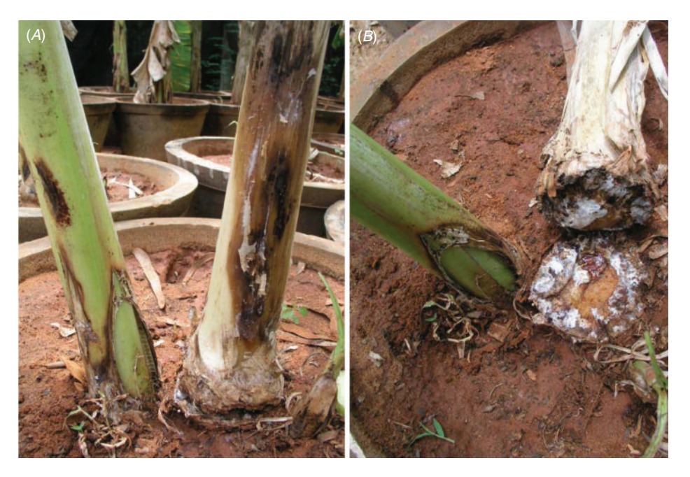
Fig. 3. Pathogenicity studies of Sclerotium rolfsii under pot culture conditions in cv. Rasthali (Silk-AAB) (A) pseudostem rotting (right) and splitting of leaf sheath at the base of the pseudostem (left). (B) Death of the entire plant with profuse growth of the fungus over the corm (right) and splitting of leaf sheath longitudinally at the base of the pseudostem.

Microscopic examination of the fungus revealed that in the profuse growth of the compact, septate, hyaline mycelium, there were protuberances that later developed into sclerotia. The number of sclerotia produced in culture on PDA (Fig. 4) ranged from 47 to 199 per 9-cm plate, and the sclerotial diameter ranged from 0.8 to 1.0 mm. Clamp connections were