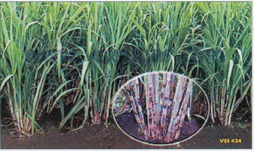
VSI 434- A promising high yielding tissue cultured variety

Both wet method and dry method of planting can be adopted for growing cane. Wet planting is mostly done in low to medium fertile soils. In this method, the furrows are thoroughly irrigated and treated setts are placed 3-5 cm deep ensuring that all the eye buds face upwards. The simple technique is to place the thumb on the middle bud and press the sett in the wet furrow ensuring that the other two buds remain sideways facing upwards. In the highly fertile soils, dry method of planting can be adopted. The setts are planted in dry furrows at specified distances (end to end incase of 3 budded, 22 to 30 cm in case of 2 budded and 30-45 cm in case of one budded