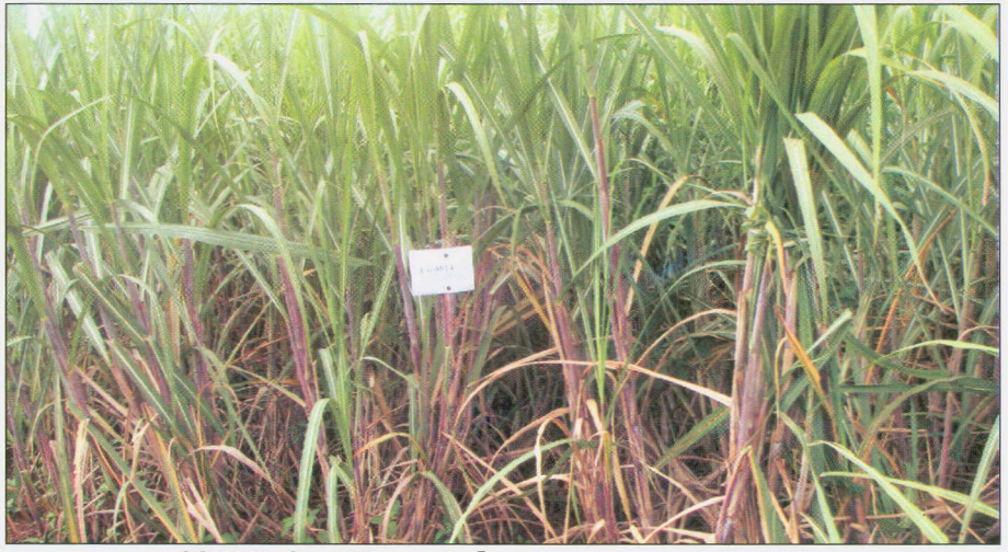
CO-8014: One of the predonitinant sugarcane varieties of Goa