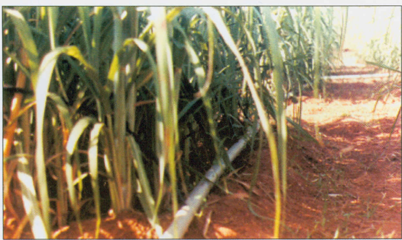
Aligning laterals and drippers in sugarcane is crucial for enhanced efficiency of drip system