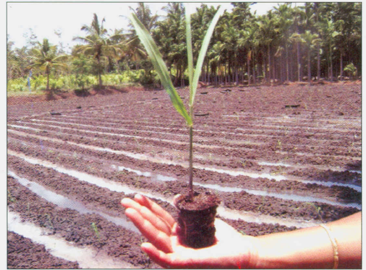
Tissue culture plantlet ready for planting

This is one of the most important aspects of sugarcane cultivation for realizing higher productivity. The utility of water will be enhanced if the soil is rich in organic content. Water is a valuable commodity and its use should be made in a most appropriate manner.