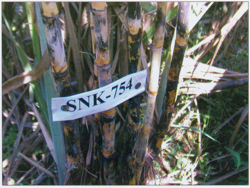
High yielding white woolly aphid tolerant sugarcane variety.