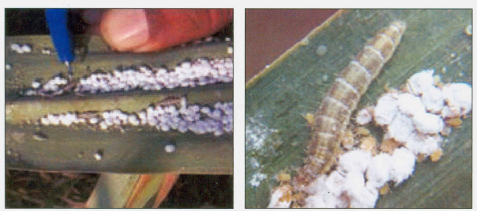
A view of wooly aphid incidence in sugarcane

Sugarcane woolly aphid is a foliage sucking pest. Wooly aphid earlier was known to be minor pest in India but has now assumed the status of economic pest after its severe outbreak in Maharashra during July 2002. It feeds on sugarcane by inserting their stylets through the stomata of the plant leaves. Both nymphs and adults suck the cell sap from