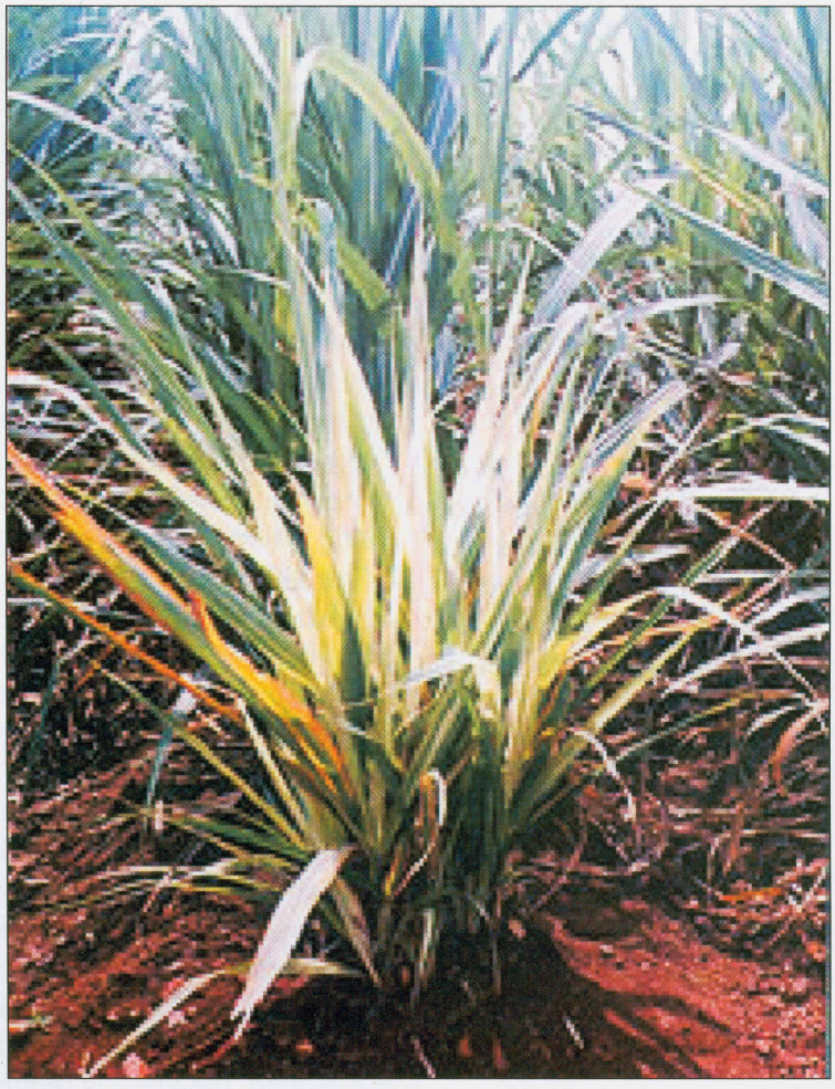
Grassy shoot- a common problem in ratoons