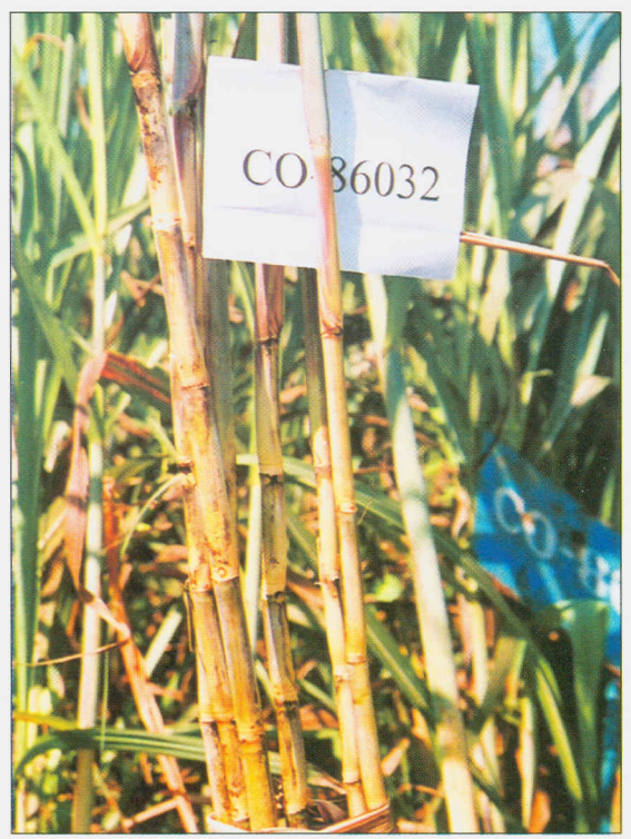
Differrent views of Co-86032, a high yielding variety suitable for Goa

type of setts for planting and subjecting them to various treatments before planting is the key to healthy crop. Always remember to change the seed after three years. Select healthy and fresh setts from specially maintained seed nurseries. Ensure following while selecting setts: