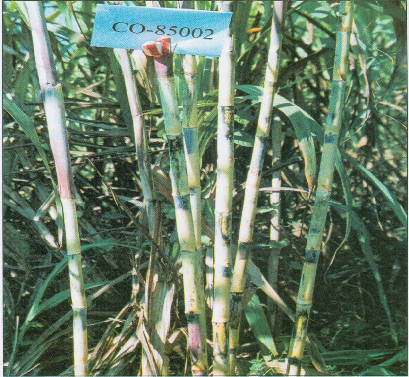
A stout erect cane variety with resistance to lodging