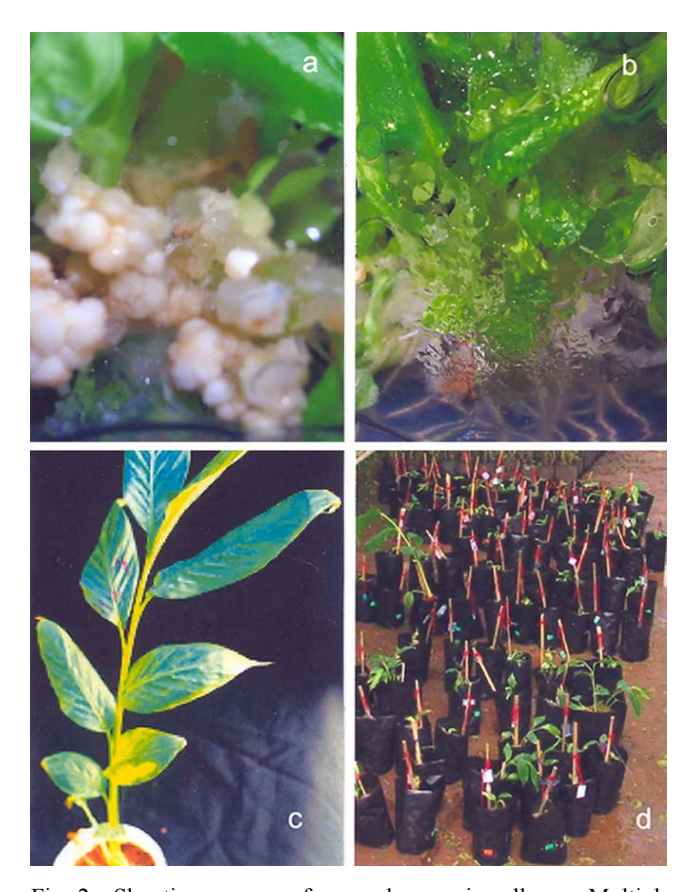
Fig. 2—Shooting response from embryogenic callus: a, Multiple shoot and root development from calli; b, Hardening of plants on vermiculite in a growth chamber; & c, Plants transferred to a mist chamber in a greenhouse

(Fig. 2d). Therefore, the present protocol described for regeneration of plantlets through embryogenic calli could be utilized for generating plants on a large-scale to induce somaclonal variation by in vitro mutagenesis