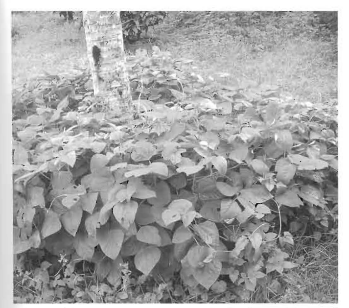
Raising green manure crop in the basin for incorporation