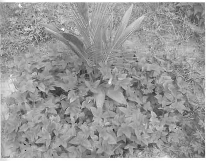
Raising cowpea in the basin of young plant