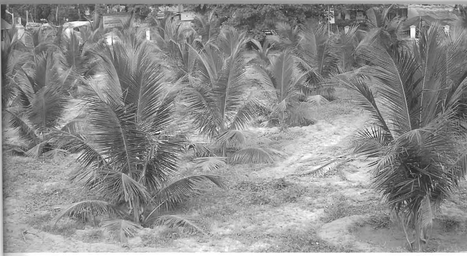
Proper spacing for better growth