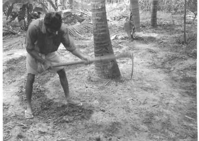
Incorporating fertilizer in the basin