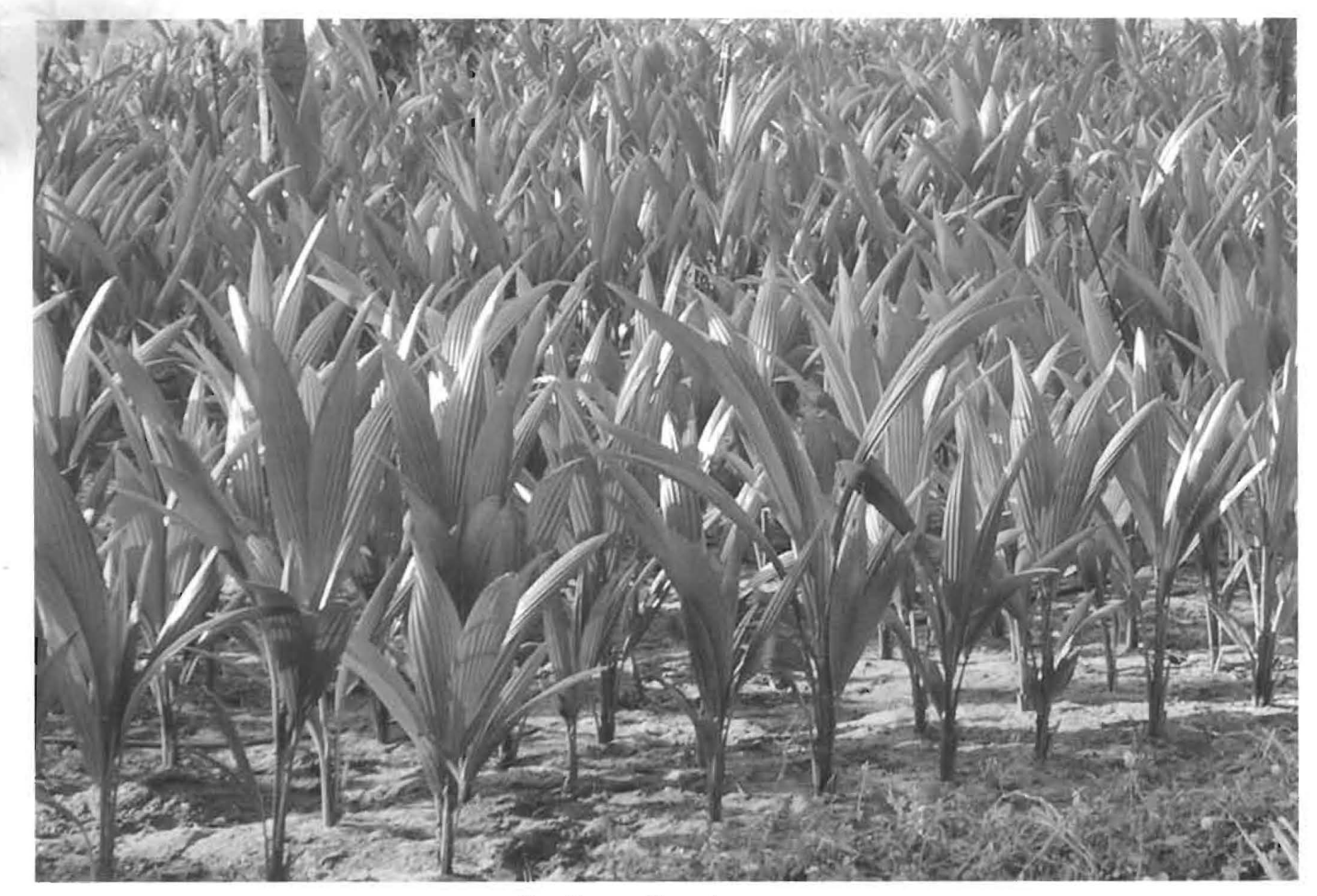
Quality seedlings in nursery

yield will be adversely affected. Ample sunlight and well aerated soil are pre-requisites for best establishment of coconut palm.