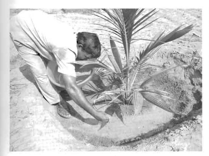
Fertilizer application for young plants