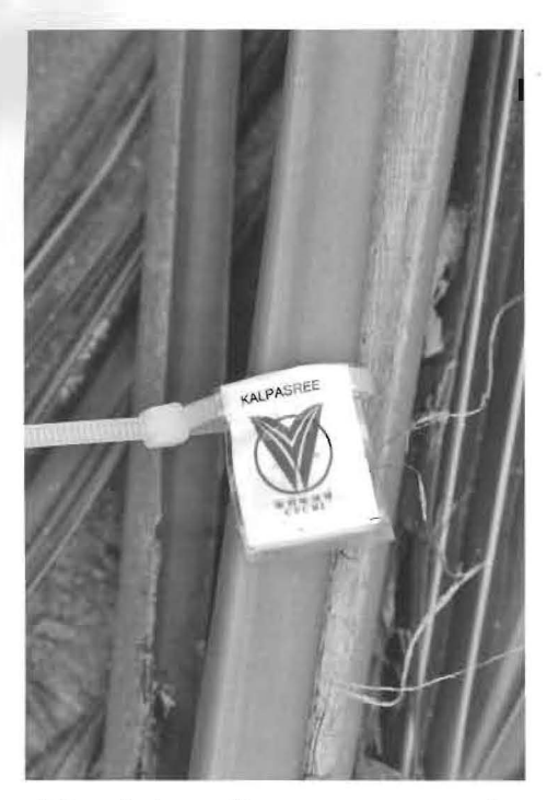
QR coded seedlings to ensure quality

up, helps to conserve soil moisture in the pits. Take a small pit at the centre of the filled pits (up to 3/4^{\text{th}} depth of pit) and plant the seedlings and put fertile top soil around the seedlings and press firmly. Apply water around the seedling immediately after planting.