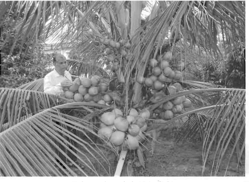
Kalpasankara hybrid in field

Juvenile palms require sufficient moisture, but at the same time, could not withstand water logging. Therefore, care should be taken not to plant coconut seedlings in areas prone water to logging or ill-drained soil which in the early growth phase gets badly affected due to insufficiency in root respiration. Even if such plants recover later on, the growth gets stunted and palm