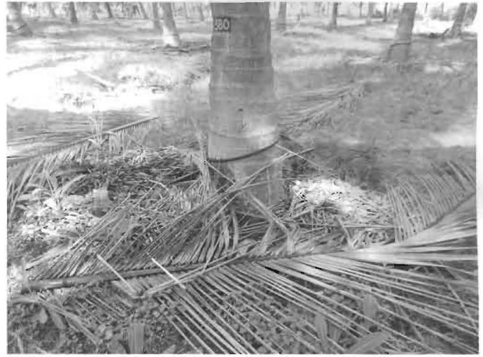
Mulching basin with coconut leaves

Crotalaria juncea (sun hemp) by sowing seeds @ 100 g in palm basins during April-May and September-October