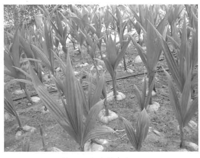
Nursery in initial stage

Under the existing homestead situations, number of palms is to be further reduced to accommodate the growing trees without compromising on light. Too close planting of seedlings with reduced spacing would induce odour cues in favour of pest orientation making the palms more susceptible to