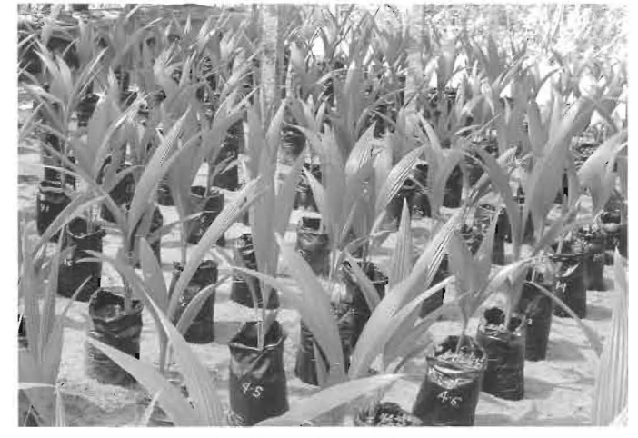
Seedlings in polybags

Coconut requires extensive feeding of plant nutrients from soil reserve. The production phenology of coconut is such that once the palm starts flowering,