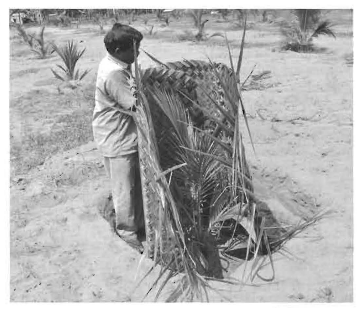
Providing shade using plaited coconut leaf