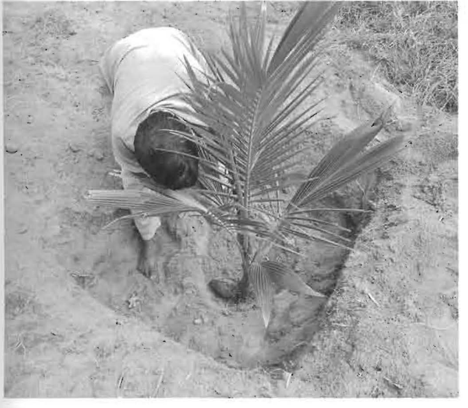
Planting of coconut seedling