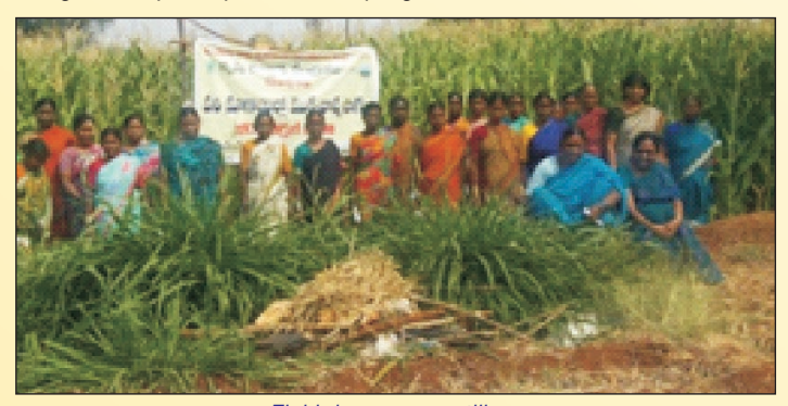
Field days on zero tillage

Field day on 'Zero tillage maize in rice fallows' was organized for farm women of Gangupally and Kandlapally villages of Pudur mandal in Rangareddy district on March 10, 2013. About 60 women from two villages had participated in the programme.