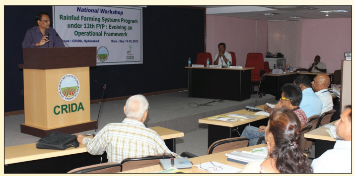
Director CRIDA interacting with participants of workshop

A National Workshop on Rainfed Farming Systems Program under 12th FYP: Evolving an Operational Framework was organised at CRIDA, Hyderabad for 2 days during 14th – 15th May 2013 jointly by CRIDA, Revitalising Rainfed Agriculture (RRA) Network through WASSAN with funding from FAO to evolve an approach to design rainfed farming systems program under the 12th Five Year Plan. The workshop was attended by representatives from Planning Commission, Ministry of Agriculture, National Rainfed Area Authority, ICAR, Govt of Andhra Pradesh, WASSAN, NISTADS-CSIR, NGOs and consultants. The discussions were centered on synthesizing the emerging innovative experiences on rainfed farming systems across the country, evolving institutional and operational mechanism(s) for facilitating convergence of schemes and program framework.