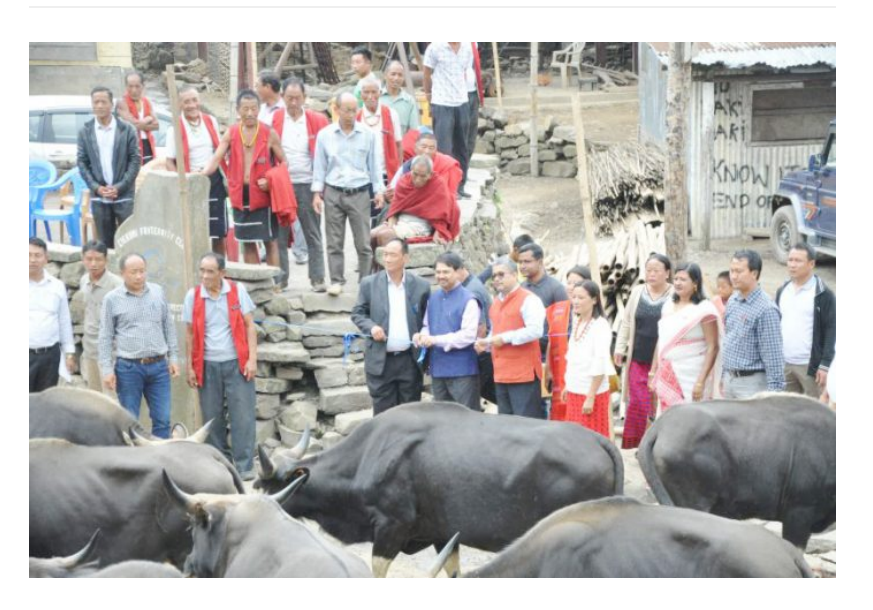
Officials and participants of the Mithun Mela cum Farmers-Scientist interaction look at a herd of Mithuns in Porba Village on June 10.

Porba, June 12 (MExN): Krish Vigyan Kendra (KVK), Phek and its host Institute ICAR-NRC on Mithun organized a one day "Mithun Mela cum Farmers-Scientist Interaction" in Porba village, Phek on June 10.