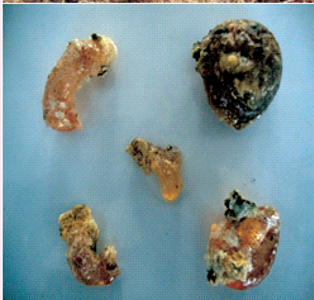
Plate 2. Gummosis and yield of gum Arabic at research farm of ICAR-CAFRI, Jhansi

Despite constraint of annapratha in Bundelkhand, the farmers of the region are getting attracted toward Gum arabic ( A. senegal ) based agroforestry models developed at CAFRI Jhansi and many farmers have planted Acacia senegal on their fields. The Institute is helping farmers and providing seedlings free of cost. In last five years about 8000 seedlings of gum Arabic ( A. senegal ) have been planted in parasai, chhatpur, bachouni (Jhansi in U.P.) shivrampur, dabar and garkundar (Tikamgarh in M.P) villages on farmers's field mainly as boundary plantation. The farmers preferred this species as it act as live fence besides yielding gum Arabic.