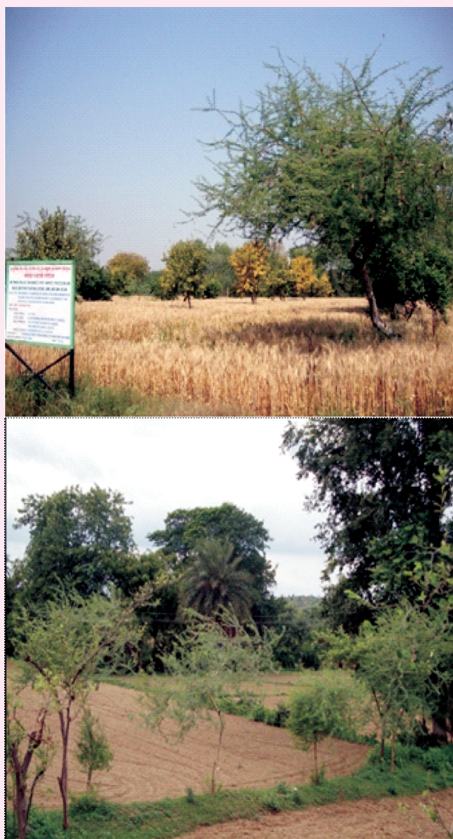
Plate 1. Acacia senegal based agroforestry models on research farm and farmer's field

per year. Mean maximum temperature ranges from 47.4°C (June) to 23.5°C (January) and mean minimum temperature from 27.2°C (June) to 4.1°C (December). The main soil types in the region are red (Alfisol) and black (Vertisol). Acacia senegal was planted in five agroforestry models (3 at research farm and 2 at farmer's field) in 2009. The models represent either agri-horti-silviculture or horti-silviculture system of agroforestry. In these models, A. senegal is planted either on boundary or as row plantation. One block plantation of Acacia senegal was also done at research farm. The performance of A. senegal has been evaluated for variation in plant height and collar diameter and exudation of gum at various sites in different models.