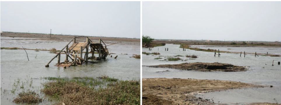
Views of flood-damaged shrimp ponds.

We recently studied the design criteria in successful farms that have effectively managed to cope with extreme climate events. Farm design modifications can help prevent farm flooding and reduce the risk of stock losses and animal escapes from the ponds. Not incorporating local, temporal and spatial dynamics of climate extreme variability in farm design can result in crop losses during episodes of heavy rains in low-lying areas. Improved designs for shrimp farms located in flood-prone areas in India and elsewhere are needed not only to protect farm structures, but also to help prevent disease outbreaks due to possible transmission of pathogens through flood waters.