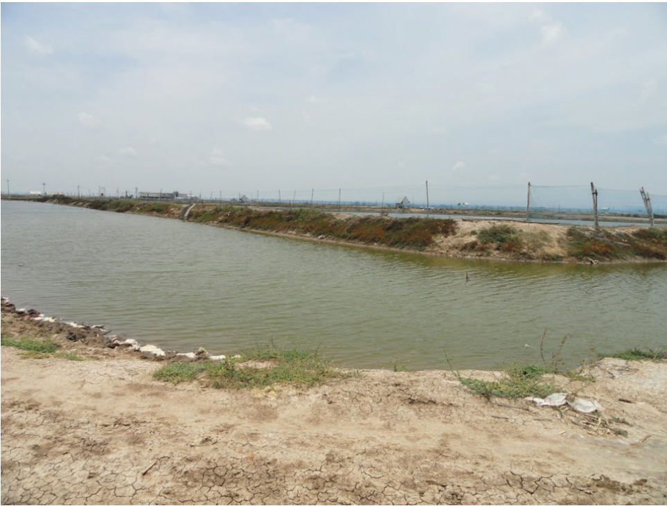
View of recirculation canal around a shrimp farm.

Most of the L. vannamei farms are operated using zero water exchange, with internal farm reservoirs providing additional water requirement during the culture period. Outer recirculation canals around the farm in low-lying areas should have a height of at least 1.8 meters above mean sea level, to help prevent overflowing water and to protect the levees during cyclones and flooding events. But this height should ultimately be based on the site elevation above mean sea level, local frequency of extreme events, and tidal amplitude.