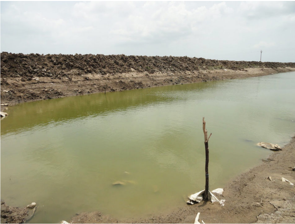
View of an outer levee along a recirculation canal at a shrimp farm.

The authors observed that the farms with recirculation canals have been able to effectively manage floods and protect their shrimp crops. The size of these canal depends on the size of the farm, and generally one canal is sufficient to connect four ponds 0.5 to 0.8 hectares each with adequate water flow management.