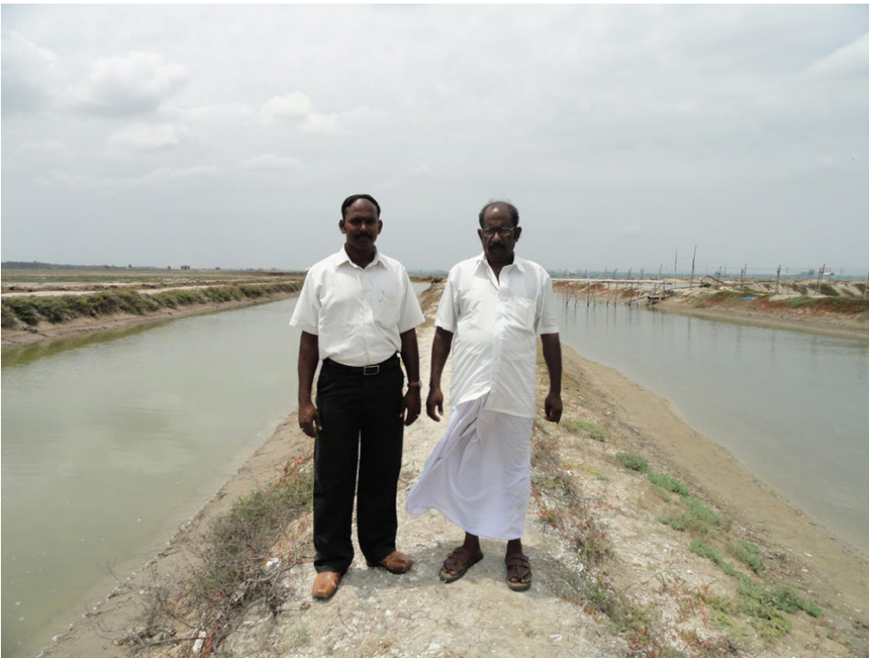
View of shrimp farmers and recirculation canals at a shrimp farm in Tamil Nadu, India.

Aquaculture, one of the fastest growing food-producing sectors that habitually develops in unutilized coastal areas, can face significant risks due to extreme weather events.