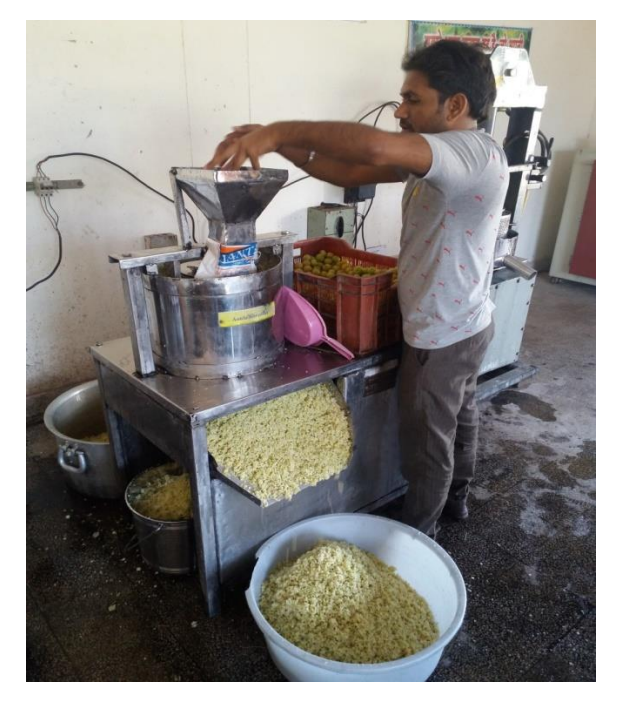
Figure 3. Aonla Shredding in Operation Performed by the Entrepreneur