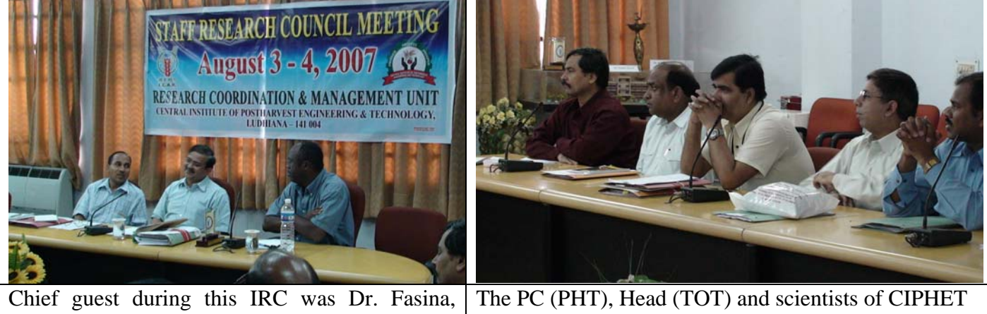
Associate Prof., Auburn University, USA

The CIPHET has organized its Institute Research Council meeting during 03 –05 August 2007 to discuss completed, ongoing and new research projects under the chairmanship of the Director. The chairman stressed that market intelligence is an important tool to assess the scope of particular technology in the market. He added that all patentable technologies should be discussed in the CIPHET Invention Disclosure form for evaluating the technology before filing patents. There were some new technologies developed under completed project like quality evaluation of apple through non-destructive technique. The Chairman said that the completed project should come out with a technical bulletin for dissemination to the end users. There were new projects in the area of fruit processing, product development, value addition, drying and coarse cereal milling. A total of 11 new projects were presented in the meeting. The progress of ongoing projects was critically reviewed. The chairman stressed that joint efforts of experts from different organizations would help to increase the success rate of the project. The institute is working jointly with NRC Seed Spices, Ajmer, ICAR Res Complex for Eastern Region, Patna, PAU, Ludhiana, PU Chandigarh, GADVASU, Ludhiana, ILRI, Ranchi etc. The house appreciated the progress made by the scientists.