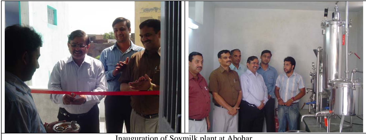
Inauguration of Soymilk plant at Abohar