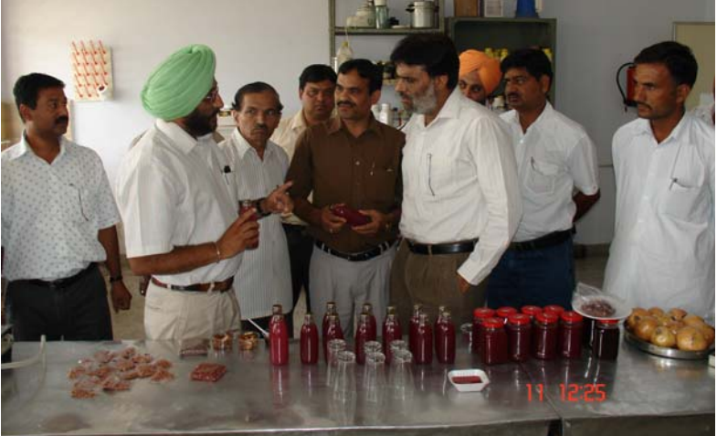
Practical training by participants