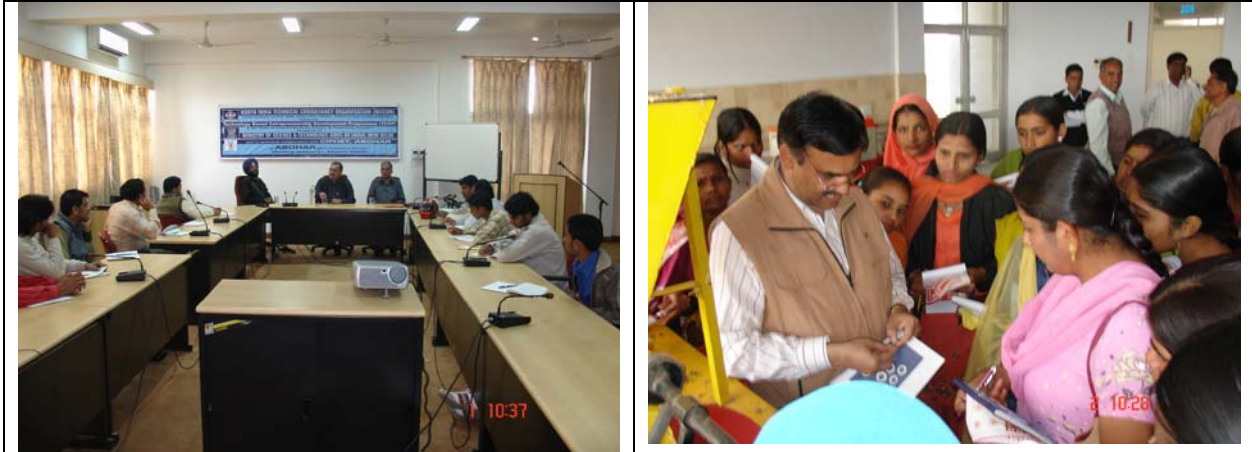
NITCON-CIPHET EDP in Food Processing at CIPHET Abohar