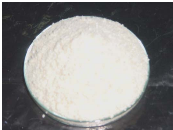
Ready to constitute makhana kheer mix

Fried makhana with salt or sugar are very widely used as snack foods. Makhana kheer is one of the delicious item being eaten in select areas of country. Popped makhana is bulky in nature and thus become costly at distant places due to high transportation cost. To overcome this product and having high acceptability a new product “ready to constitute makhana kheer mix” has been developed.