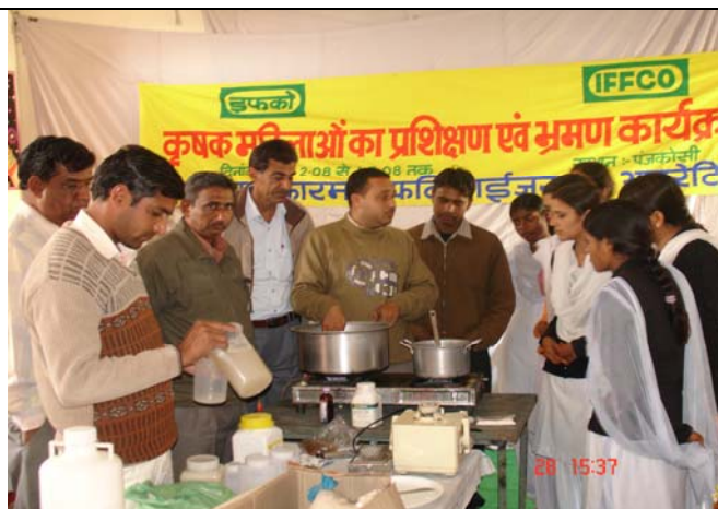
Training and demonstration in progress