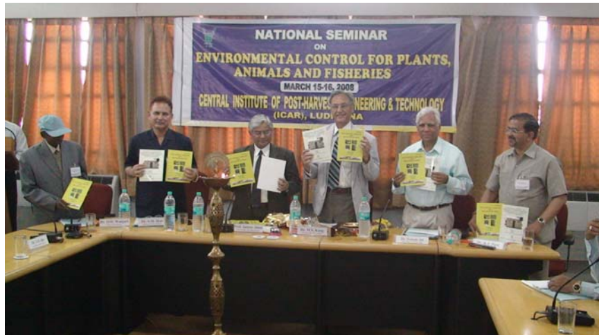
Institute publications being released by Chief Guest and Guests of Honour