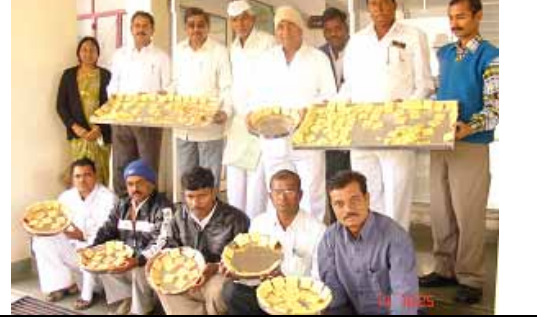
One week EDP on guava processing