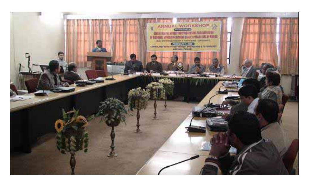
Annual Workshop of NAIP Project on Non-Destructive Systems for Microbial and Physico-Chemical Quality Parameters of Mango

together to accelerate the R & D in the field of nondestructive methods of quality evaluation of food in India.