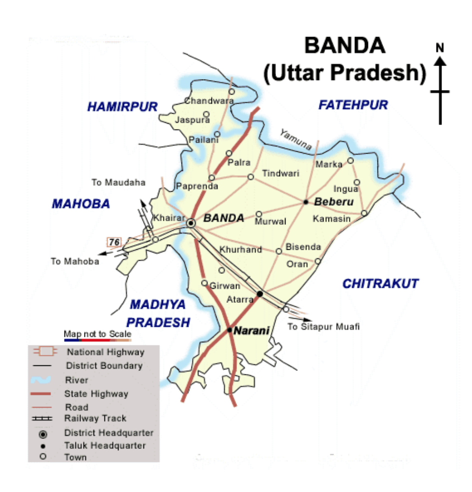
Annexure 01: Location map of the Uttar Pradesh state and district Banda