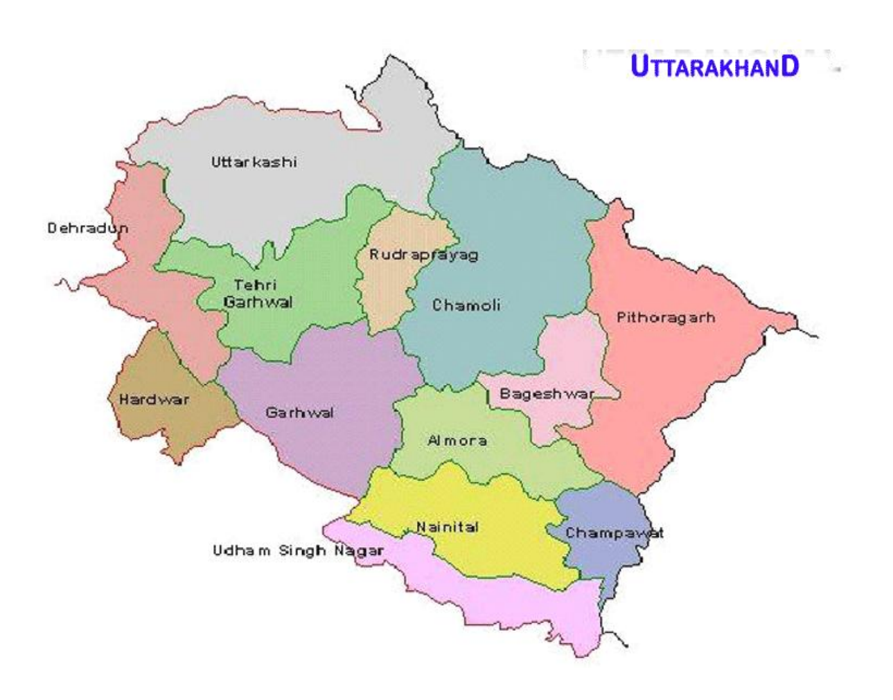
Annexure 01: Location map of the Uttarakhand state and district Nainital