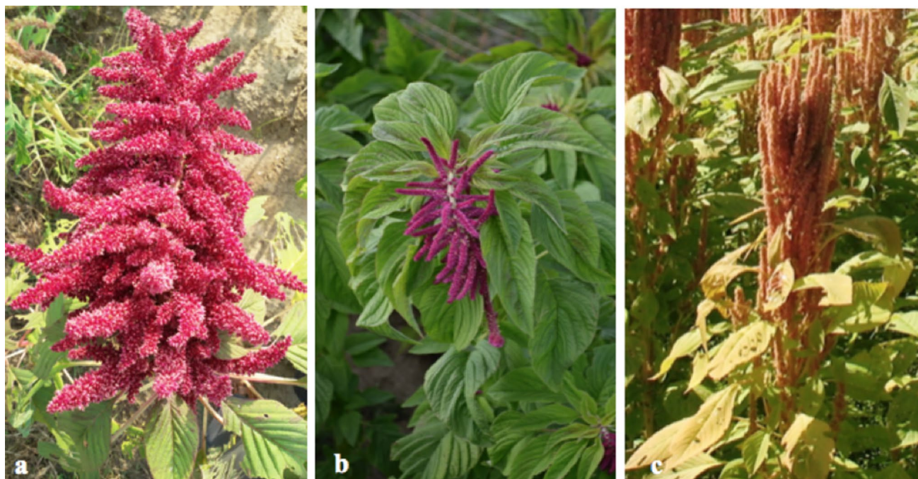
Fig. 1 Inflorescence of three grain amaranth species. a A. hypochondriacus ; b A. caudatus ; c A. cruentus

Amaranth has a particularly favorable composition in essential amino acids, and its protein quality is much higher than conventional food sources like wheat, barley and maize (Venskutonis and Kraujalis 2013). Most cereal grains are generally deficient in the essential amino acid lysine and contain excess of leucine, isoleucine and valine (Table 1), while amaranth is rich in lysine (5.2–6.1 g/100 g protein) and therefore has a well-balanced composition of amino acids (Mlakar et al. 2009). Similarly, sulfur-containing amino acids in amaranth (2.6–5.5 g/100 g) are comparatively higher than in most of the legume species (1.4 g/100 g; Juan et al. 2007). The sum of essential amino acids ranged from