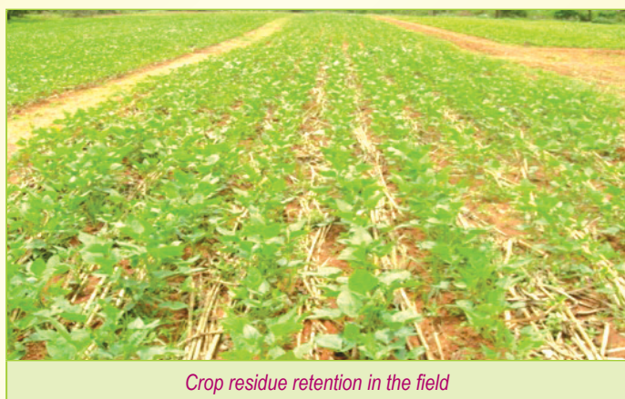
Crop residue retention in the field