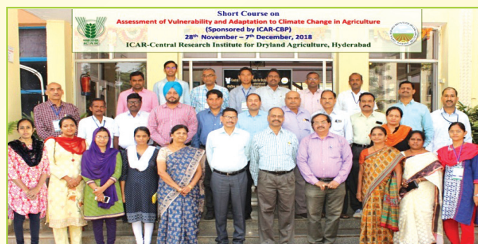
Participants of ICAR Short Course on “Assessment of Vulnerability and Adaptation to Climate Change in Agriculture”

A ten day short course on ‘Assessment of vulnerability and adaptation to climate change in agriculture’, sponsored by the Agricultural Education Division of the ICAR, was conducted during 28 th November to 7 th December, 2018 at ICAR-CRIDA. The short course has provided the participants with various concepts, approaches and methods used in assessing vulnerability and adaptation. Twenty one participants from five ICAR institutes and eight state agricultural universities participated. A majority of the participants expressed that their expectations from the short course were fulfilled to a large extent.