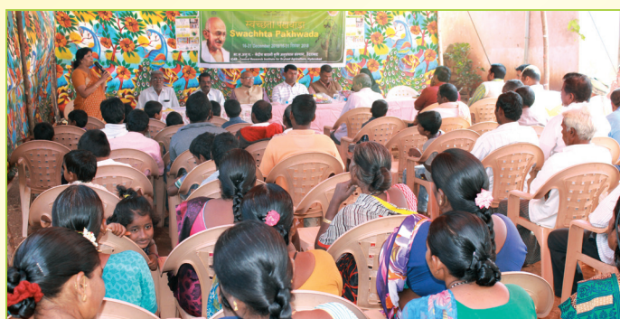
Swachhtha Pakhwada Celebration at farmers first village

Swachhtha Pakhwada was celebrated by ICAR-CRIDA during 16-31 December, 2018. The date-wise activities set out in the programme were implemented at ICAR-CRIDA main office, Hayathnagar Research Farm, Gunegal Research Farm and surrounding residential areas and in villages, involving all the employees of ICAR-CRIDA, farmers and civil society members, VIPs, media persons.