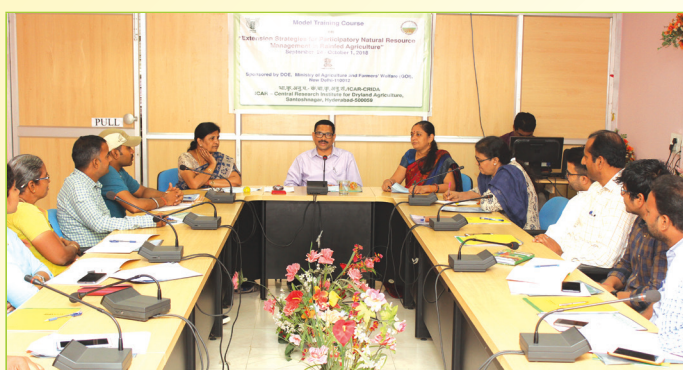
Inaugural session of Model Training Course on “Extension Strategies for Participatory Natural Resource Management in Rainfed Agriculture”

Model Training Course sponsored by DOE was organised at ICAR-CRIDA during September 24 - October 1, 2018. Twenty eight officials from eight different states viz., Telangana, Andhra Pradesh, Maharashtra, Odisha, Tamil Nadu, Goa, Punjab and Karnataka attended the model training course. The course covered various extension strategies of Soil and water conservation measures for enhanced productivity in drylands, Technologies for sustainable NRM in Rainfed areas, Horticulture systems in Rainfed Agriculture for sustainable NRM and enhanced productivity, Enhancing productivity of crops and cropping systems through effective use of natural resources, Farming systems approach for sustainable NRM in drylands, Role of Livestock and their management for enhancing productivity and income in drylands, Gender mainstreaming in NRM, Communication tools and techniques for sustainable NRM.