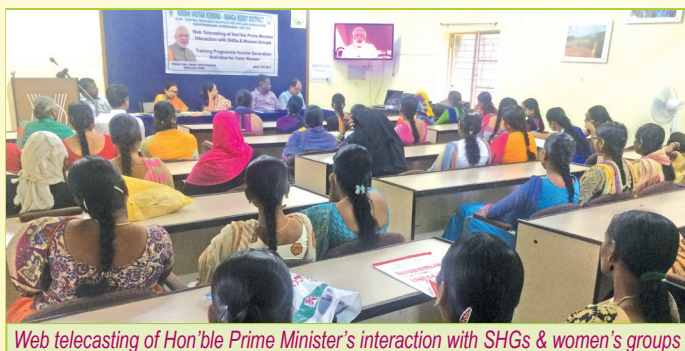
Web telecasting of Hon'ble Prime Minister's interaction with SHGs & women's groups

Web telecasting of Hon'ble Prime Minister's interaction with SHGs & Women's groups was organized by Krishi Vigyan Kendra – Ranga Reddy District, ICAR-CRIDA on 12.07.2018 in KVK Campus, Hayathnagar Research Farm, ICAR-CRIDA. About 74 SHG women from four different villages of Ranga Reddy District, Telangana State participated. The Hon'ble Prime Minister's interaction with SHG women emphasized on improving the economic status of farm families through supporting SHG women by strengthening the Self Help Groups. The Prime Minister highlighted about DAY-NRLM programme (Deen Dayal Antyodaya Yojana-National Rural Livelihood Mission). Almost 30 lakh SHG women are being supported under Mahila Kisan Sashaktikaran Pariyojana (MKSP) to promote sustainable agriculture practices and the objective of Mission Antyodaya is to develop poverty free panchayats.