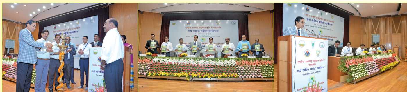
Various events during sixth NICRA annual review workshop