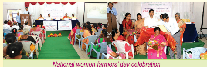
National women farmers' day celebration

Two brochures on Good management practices of chickpea and redgram cultivation, pamphlets on fall army worm in maize, pink bollworm in cotton, hydroponics in fodder cultivation, balanced nutrition diet for livestock were released. Five progressive women farmers and women entrepreneurs from Ranga Reddy District were felicitated on this occasion.