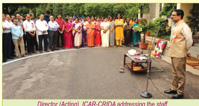
Director (Acting), ICAR-CRIDA addressing the staff

The 72 nd Independence Day was celebrated on August 15, 2018 with pride and patriotic zeal. The Director hoisted the flag and addressed the staff of CRIDA. In this occasion, Director distributed cash awards (CCS & CCRC) to the X class toppers of CRIDA staff children and motivated the staff with his message to work with dedication and boost institute's growth.