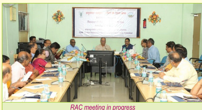
RAC meeting in progress