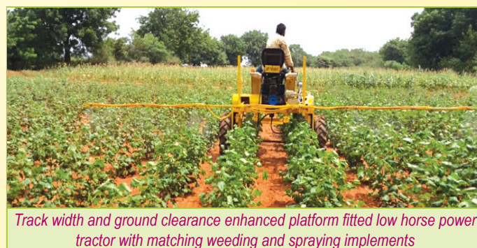
Track width and ground clearance enhanced platform fitted low horse power tractor with matching weeding and spraying implements

The prototype high clearance platform fitted mini tractor matching rotary weeder consists of a main frame with hitch mast, gear box housing with power transmission provision, rotor shaft assembly with soil working tools. The developed boom sprayer unit basically consists (i) Base frame to give support / fix various components (ii) Pump with manifold for flow control and pressure regulation (50 lpm & 30kg / cm 2 rating) (iii) Boom with height adjustable frame work and (iv) High pressure hose pipes. The pump gets the required power from tractor. The nozzles on the boom were fitted with spacing adjustable provision to use for different types of rainfed crops. The weeding efficiency of rotary machine varied 74 to 82.5.% and 78.5 to 86.8% for castor and pigeon pea, respectively. In case of maize crop, the weeding efficiency observed to be 73.9%, which was low compared to other two crops due to narrow row spacing. The boom sprayer was operated in cotton crop at two growth stages; the first one at flowering stage (75 DAS) and second operation in bolls expansion stage (90 DAS). The operator can steer the tractor comfortably and sprayer worked satisfactorily. The field capacity of the machine ranged from 1.7 - 2.0 ha/hr. The newly developed implements shown significant advantage in monetary terms when compared with traditional practice of bullock operated blade harrow and hand labour spray operation (15 - 20% lower cost).