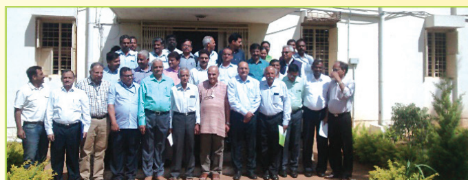
QRT visit to AICRPDA center, Bengaluru