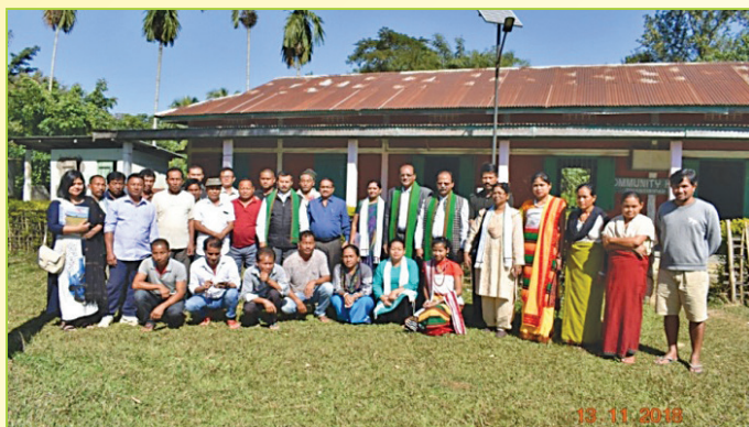
ZMC with VCRMC members, Dimapur

to review the technical progress of different modules like NRM, crop production, livestock & fishery and institutional interventions in the NICRA villages and for making appropriate suggestions for improvement.