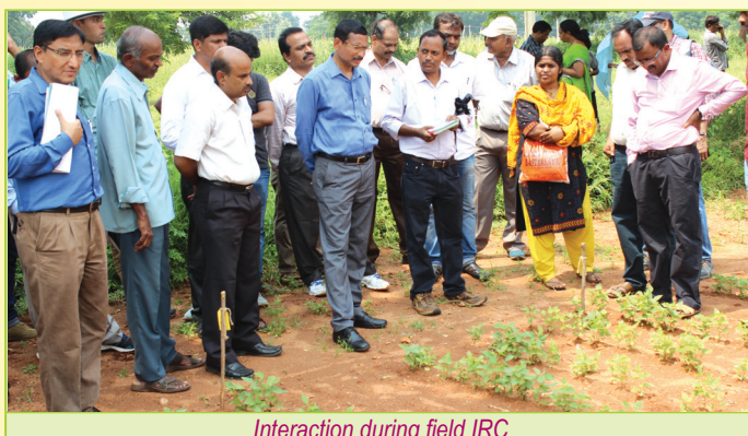
Interaction during field IRC