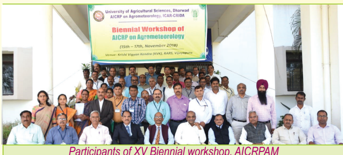
Participants of XV Biennial workshop, AICRPAM

The XV th Biennial workshop of the AICRP on Agrometeorology (AICRPAM) was organized at Regional Agricultural Research Station, University of Agricultural Sciences, Vijayapura, Karnataka during 15-17 November, 2018.