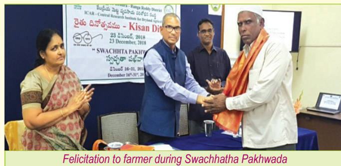
Felicitating to farmer during Swachhtha Pakhwada