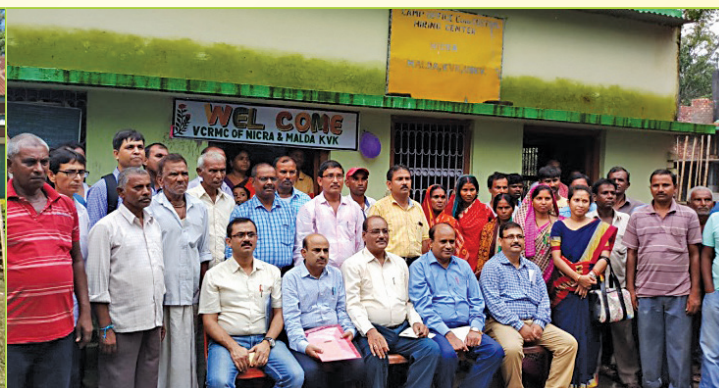
ZMC with VCRMC members, Malda