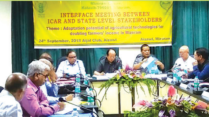
Interface meeting at Mizoram