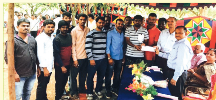
Director (Acting), ICAR-CRIDA distributing prizes to winners

ICAR-CRIDA Cultural and Recreation Club organized Vanamahotsavam at Hayathnagar Research Farm of the institute on 20 th November, 2018. All the CRIDA staff members actively participated in the cultural activities. The events generated great enthusiasm and unity among staff.