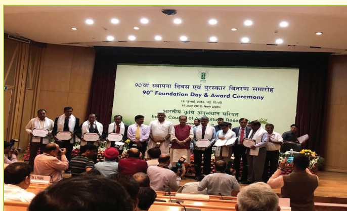
AICRPDA Vijayapura centre receiving ICAR-Vasanthrao Naik Award