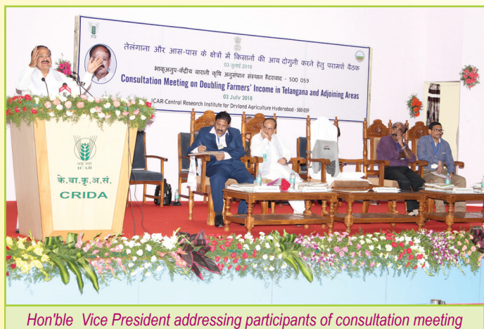
Hon'ble Vice President addressing participants of consultation meeting

Hon'ble Vice President Shri. M. Venkaiah Naidu, chaired the interactive session with scientists, research scholars, farmers and representatives of NGOs. He stated that the multifaceted strategy is needed to protect agriculture as agriculture is now under distress. During interactive session, farmers of Ranga Reddy district mentioned that their farm income has been substantially increased due to the interventions of ICAR-CRIDA, KVKs and SAUs.