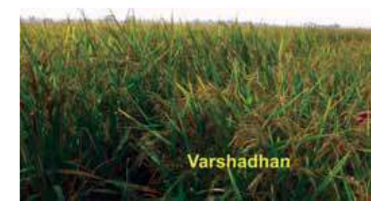
Fig. 4. Popular rice variety, Varshadhan in water logged condition at Sandeshkhali-1 block of Sundarban.

Swarna-Sub1 was used as one of the parent with AC 20431B (donor parent) for mapping and identification of 21 days submergence tolerance genes other than Sub1 . A set of 568 F_2 plants were submerged for 21 days. Based on selective genotyping results, a marker RM27322, located on chromosome 11 was found to be linked with 21 days submergence tolerance. This marker will be further validated by genotyping of fixed population (NRRI Annual Report 2017).