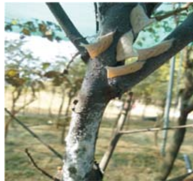
Fig. 4. L. conspersa nymph and adult on ber