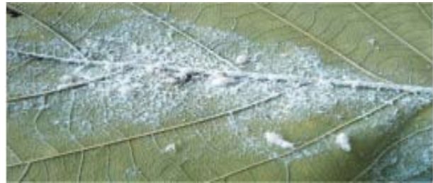
Fig. 2. L. conspersa nymph on palas