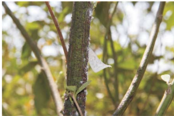
Fig. 3. L. conspersa adult on red gram