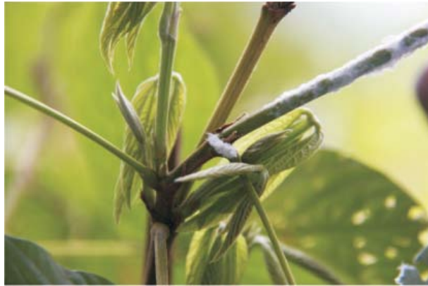
Fig. 1. L. conspersa nymph on Flemingia spp

Z. mauritiana (ber) , and Dalbergia assamica (Figs. 1-4). L. conspersa , nymph was observed in November-December and adult collected during February-March at the Institute Research Farm, Indian Institute of Natural Resins and Gums, Namkum, Ranchi. The presence of this planthopper was revealed by the long, curled filaments of waxy exudates on the undersides of succulent leaves or on the terminals of branches (Fig. 5). This woolly material often obscured the nymph producing it. Eggs are laid into young twigs