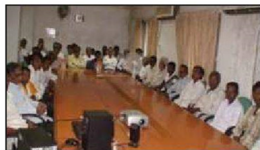
Photo 13.12: Celebration of World Conservation Day at IISWC RC, Vasad on August 5, 2014

फोटो 13.12: भा.म.ज.सं.सं. अनु. केंद्र, वासद पर 5 अगस्त 2014 को विश्व संरक्षण दिवस समारोह का आयोजन