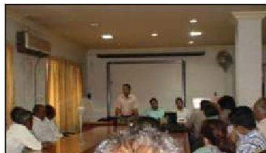
Photo 13.11: Centre's Foundation Day Celebration with farmers at RC, Vasad on May 9, 2014

फोटो 13.11: वासद केंद्र द्वारा 9 मई 2014 को किसानों के साथ अनुसंधान केंद्र स्थापना दिवस का आयोजन