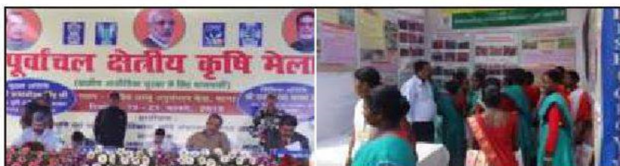
Photo 13.18: Research Centre participated in the Eastern Zone Regional Agriculture Fair 2015 during February 19-21, 2015 organized by CPRS, Patna

फोटो 13.18: केंद्रीय आलू अनुसंधान केंद्र, पटना, द्वारा आयोजित 19-21 फरवरी 2015 के दौरान पूर्वी क्षेत्र के क्षेत्रीय कृषि मेला 2015 में अनुसंधान केंद्र, कोरापुट की भागीदारी