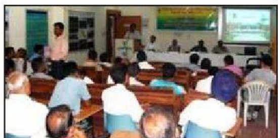
Photo 13.14: Address by dignitaries during centre's Foundation Day function

फोटो 13.14: केन्द्र के स्थापना दिवस पर अतिथि द्वारा सम्बोधन