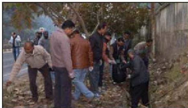
Photo 13.2: Officers and staff, IISWC, Dehradun cleaning the surrounding of Institute after 66 th Republic Day celebration under Swachh Bharat Mission Call of Hon'ble Prime Minister

respective office rooms and working areas. Similar activities were also taken up on the other occasions, viz; New Year Day of 2015, after celebrations of 66 th Republic Day on January 26, 2015, the officers and staff of IISWC, Dehradun cleaned the premises around the residences and office building (Photo 13.2). At village Pasauli, Dehradun, Institute project team on February 24, 2015 in which students, teachers and staff of Junior High School, Pasauli actively participated in the cleanliness drive to clean the school campus, village premises and educate the villagers.