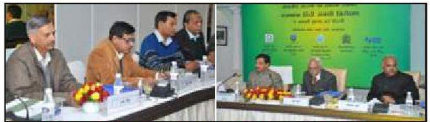
Photo 13.9: Inspection of ICAR-IISWC RC, Udhagamandalam by the Committee of Parliament on Official Language at New Delhi on January 01, 2015

फोटो 13.9: 1 जनवरी 2015 को भा.मू.ज.सं.सं. अनु. केंद्र, उदगमंडलम् का संसदीय राजभाषा समिति, द्वारा नई दिल्ली में निरीक्षण