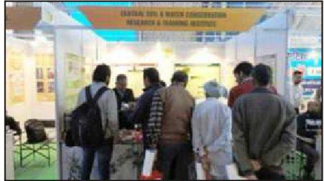
Photo 13.4: Res. Centre, Chandigarh exhibited the research activities in a stall at Agro-Tech 2014 during Nov. 22-25, 2014

फोटो 13.4: अनुसंधान केंद्र, चंडीगढ़ द्वारा एग्रो टेक 2014 के प्रदर्शनी स्टाल पर आगतुकों की रुचि का एक भय