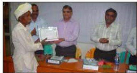
Photo 13.13 : Chief Guest honouring the Farmer's on the occasion of Farm Innovators Day celebration