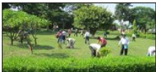
Photo 13.15: Cleanliness drive in office compound and residential complex under Swachh Bharat Abhiyan during Swachhta Saptah

फोटो 13.14: केन्द्र के स्थापना दिवस पर अतिथि द्वारा सम्बोधन