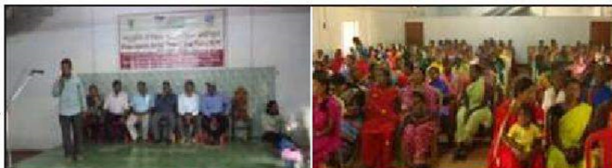
Photo 13.16: Awareness initiatives and meeting with SHG members of TSP adopted villages of Koraput district in Odisha

four TSP adopted villages (Mukhibidai, Patraput, Chalanput and Podagarh) under Semiliguda Block of Koraput participated (Photo 13.16). Various issues of SHGs, were discussed. General feedback of the SHGs members are listed as: Problem in transportation and marketing of produce; Non availability common meeting hall for SHGs; Non-availability of timely financial support to the groups; Non availability of quality mushroom spawns; Needs support for additional activities to strengthen their groups; needs of some implements and tools; and Water resource development, pumping and micro irrigation.