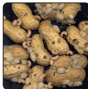
Fig. 6: Infested pods