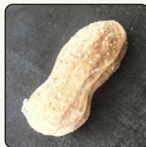
Fig. 2: Eggs on pod surface