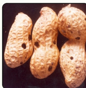
Fig. 7: Exit holes made by bruchids