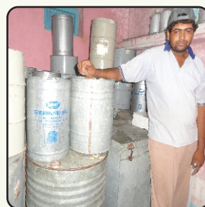
Fig. 10: Farmer storing seeds in galvanized metal bins