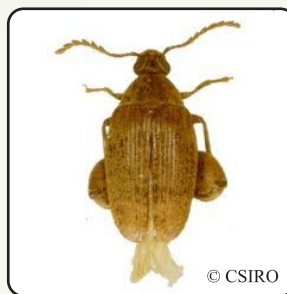
Fig. 1: Adult