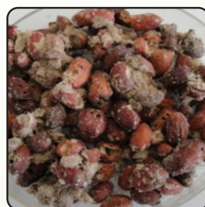
Fig. 8: Mould growth on infested kernels