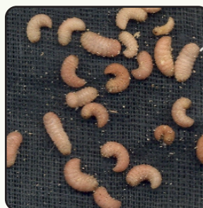
Fig. 3: Grubs