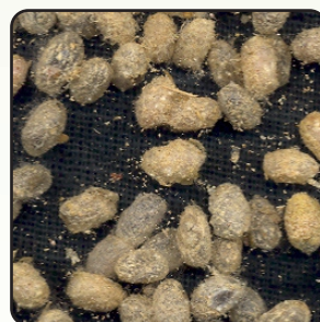
Fig. 4: Pupae in cocoons