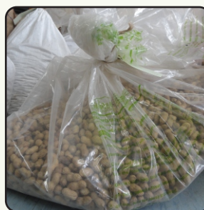
Fig. 9: Pods stored in super grain bag