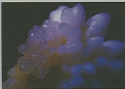
Fig. 2: Torpedo and heart shaped embryos

The globular embryos (Fig. 1) with clear suspensor region appeared and multiplied. On subculture to fresh media, the other stages such as torpedo and heart shaped embryos were seen. (Fig. 2) On transfer to light in Y3 media containing BA (2 \mu M) and ABA (1 \mu M) they matured into complete plantlets. In 2% of the cultures, secondary embryogenesis was also seen.