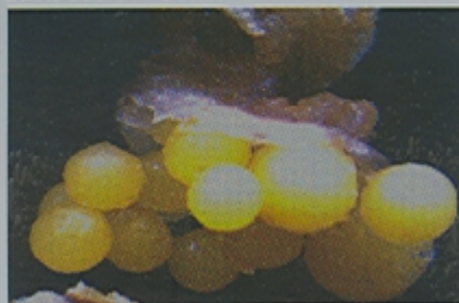
Fig. 1: Globular embryos

In oil palm though regeneration has been reported from several explants, the pathway of regeneration has been through callus. Direct embryogenesis without callus phase was obtained from cotyledonary nodes of germinated immature zygotic embryos of oil palm ( Elaeis guineensis ) hybrids viz. DG1 and DG21. Direct embryogenesis was achieved when the cotyledonary nodes of germinated immature zygotic embryos were cultured in dark for 8 weeks.