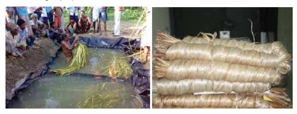
Plate. 9. Vertical steeping of green ribbons in retting tank