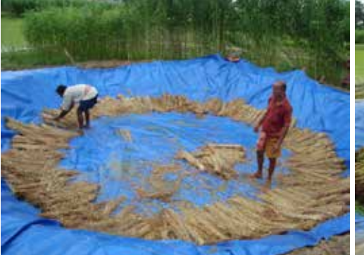
Plate. 11. Radial straw arrangement periphery of in-situ retting tank

that farmers need not carry their harvested jute/mesta to a distant retting site for retting (Ghoral et al. , 2009a, b). This retting tank is lined with polyethylene sheet, which is sufficient to ret jute/ mesta harvested from one bigha (0.13 ha) of land with the help of CRIJAF microbial retting formulation in a 1: 1 ratio of jute plants: water within 12- 15 days with 2 to 3 grade improvement in fibre quality (Plate. 11-14). Microbial formulation with a cfu of 10^{10} to 10^{12} /g of formulation is applied in the retting tank over the jute bundles in each layer @ 4 to 6 kg for jute or mesta plants harvested from one bigha (0.13 ha) land.