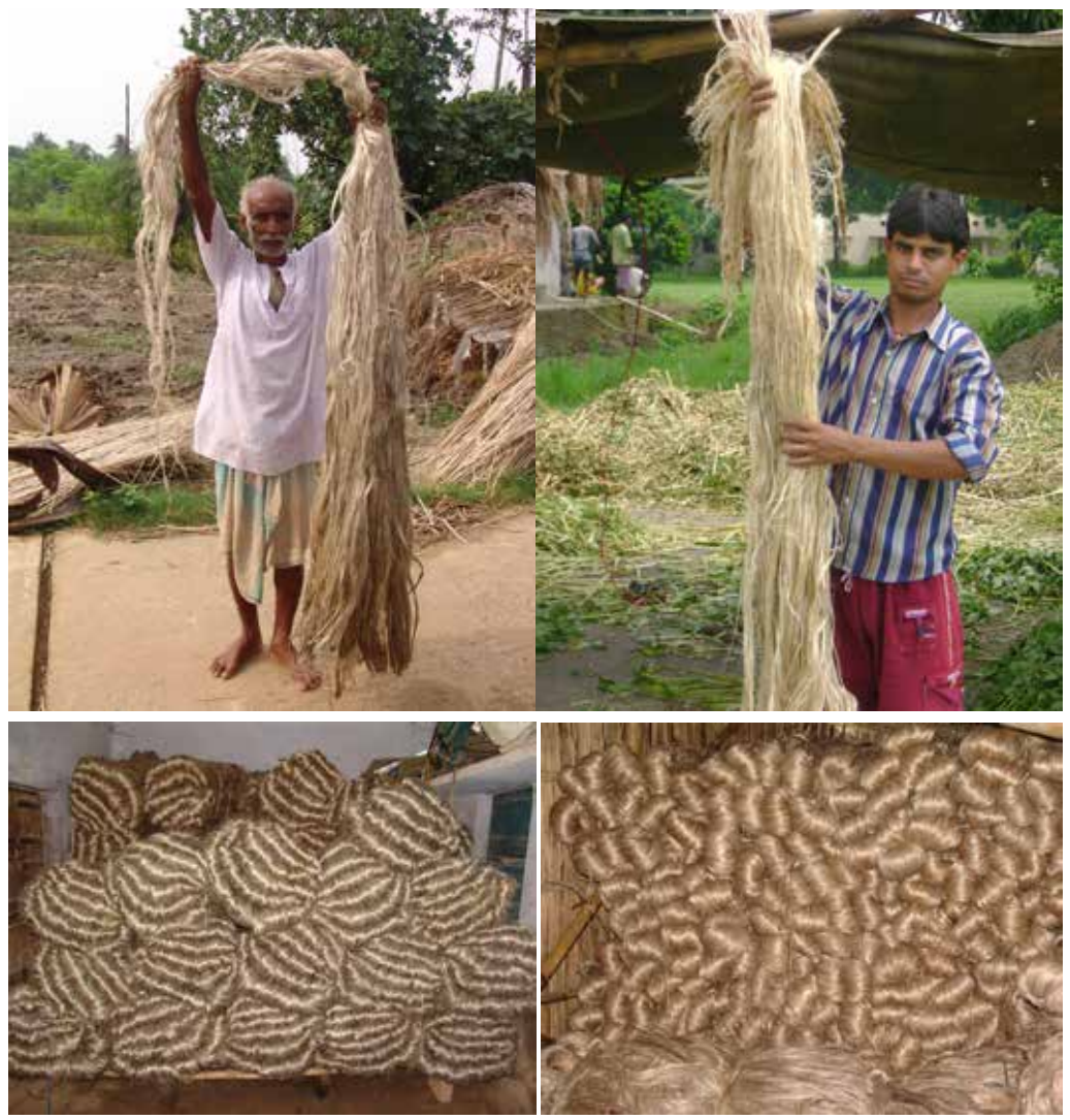
Plate 19. Golden and lustrous jute fibre obtained by the farmers with microbial formulation