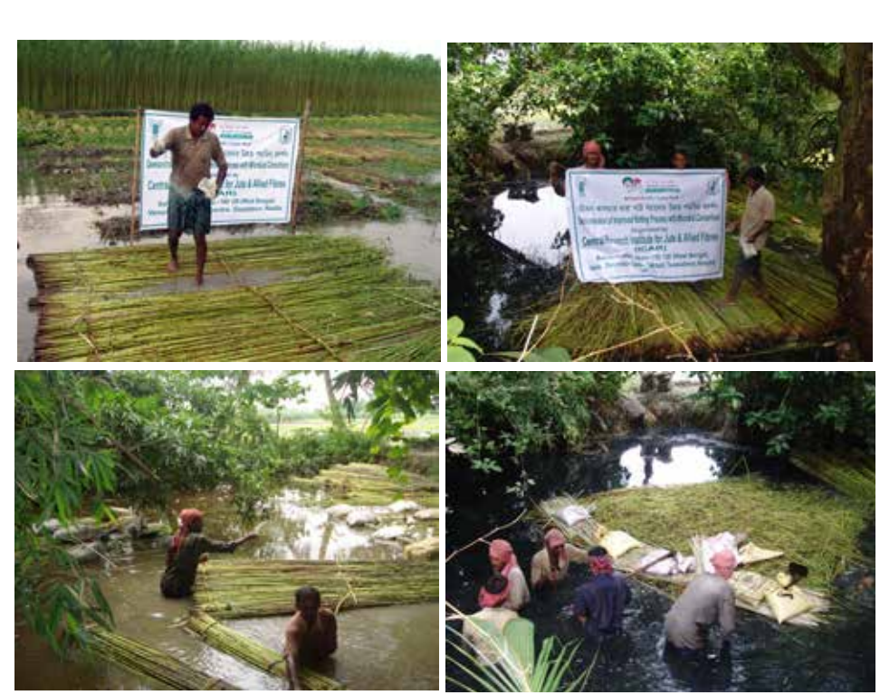
Plate. 16 . Application of microbial formulation over the jute bundles in retting tank