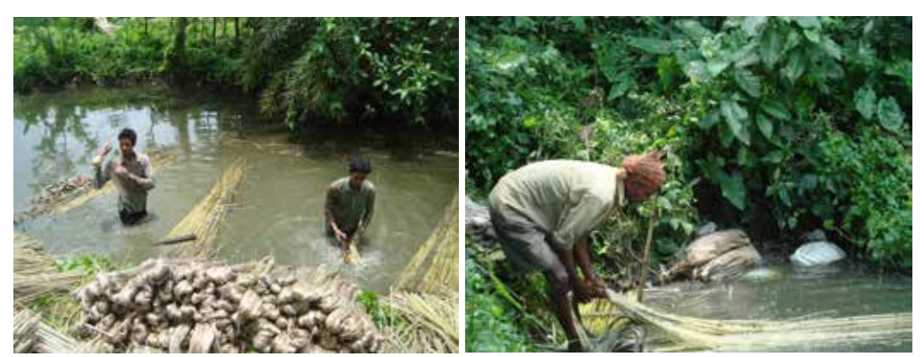
Plate 18 . Extraction and washing of fibre after retting