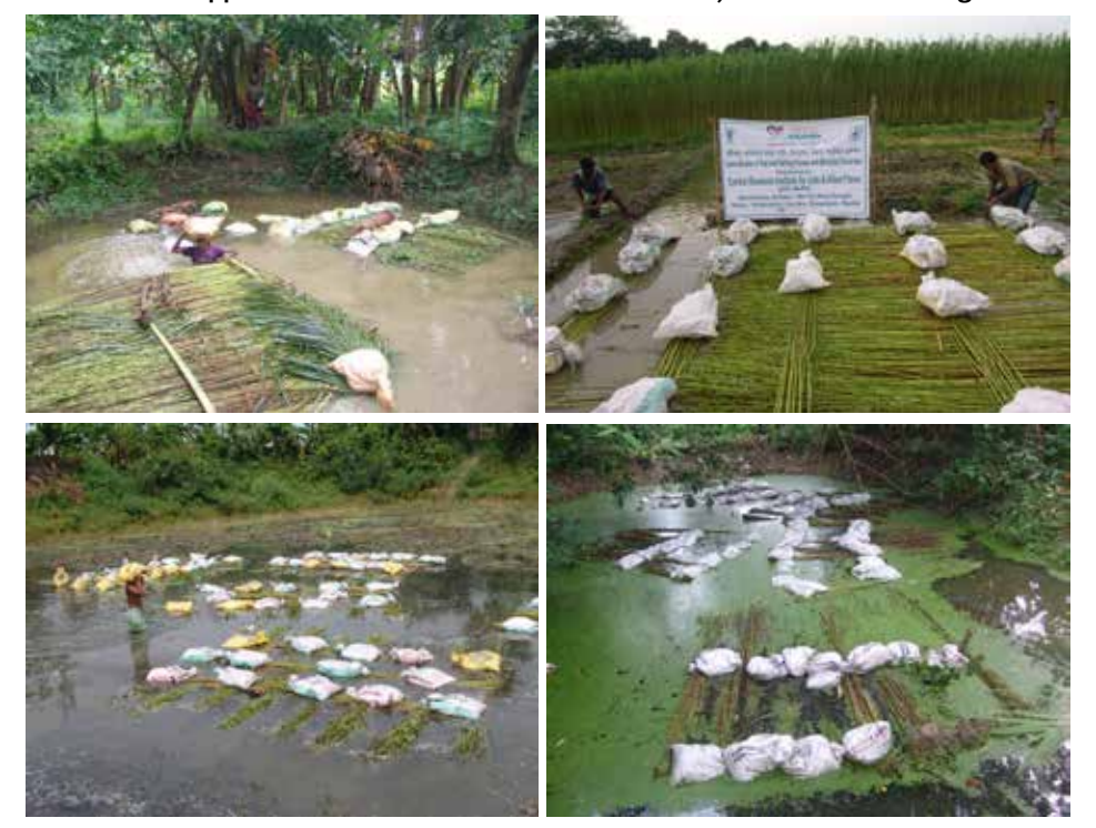
Plate 17 . Retting in progress with microbial formulation in stagnant water under farmers field