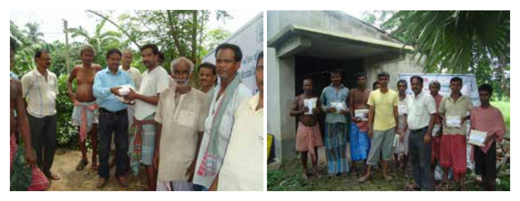
Plate. 15. Distribution of talc based formulation among the farming community

The talc based microbial formulation developed by CRIJAF was extensively demonstrated in various jute growing districts of West Bengal, Bahraich district of Uttar Pradesh and mesta growing district of Andhra Pradesh during the retting season of 2012. By using this talc based formulation in natural retting tank, the retting period was reduced by 6 to 7 days with improvement in fibre quality by