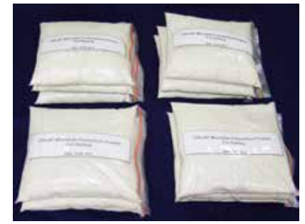
Plate 5. CRIJAF microbial formulation

form. To overcome this, search for suitable carrier materials which can be used for the development of powdery formulation of microbial consortium with increase viability was carried out. Several carrier materials like charcoal, jute leaf manure, and talc were tested to find out the suitable one for powdery formulation of microbial consortium.