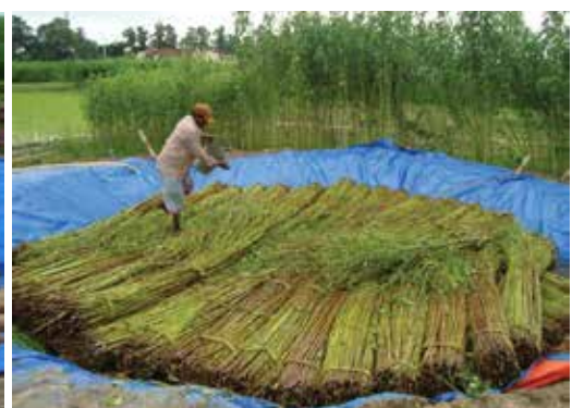
Plate. 12. Spraying of microbial along the consortium