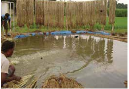
Plate. 14. Fibre extraction in the in-situ retting tank