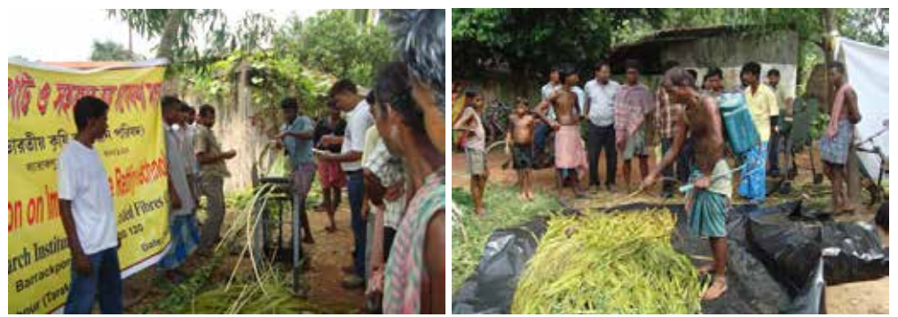
Plate. 7. Extraction of green ribbons using CRIJAF jute ribboner

The green ribbons extracted by either of the above mentioned extractors are then kept in polyethylene lined or concrete retting tank for retting (Plate. 8, 9 & 10). The green ribbon: water is kept as 1: 5. The green ribbons: water ratio should be maintained strictly for application of formulation and proper retting. Microbial formulation @ 1 kg/2q of ribbons with a cfu of 10<sup>10</sup> to 10<sup>12</sup>/g of formulation is added in the retting water of the tank. After completion of the retting, ribbons are washed in clean water for obtaining good quality fibre. The same retting water can be used for retting again, by removing half of the water and filling it with fresh water. No fresh application of formulation is needed for further retting in the same retting tank. This method has been successfully demonstrated to among jute farmers' of four districts of West Bengal (North 24 Pargana, Hooghly, Nadia and Murshidabad) and Purnia and Katihar districts of Bihar (Annual Report, CRIJAF, 2009-10).