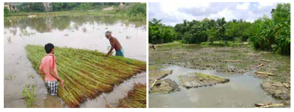
Place 1. A typical "Jak" of jute bundles retting

by "beat-break-jerk" or single plant extraction method which varies from place to place. The farmers using or selling jute stick as fencing or roof materials prefer single plant extraction method, whereas, farmers using jute sticks for fuel