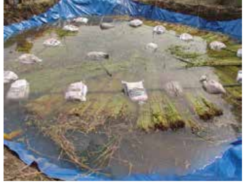
Plate. 13. Sand-filled bags over the 'jak' to avoid floating