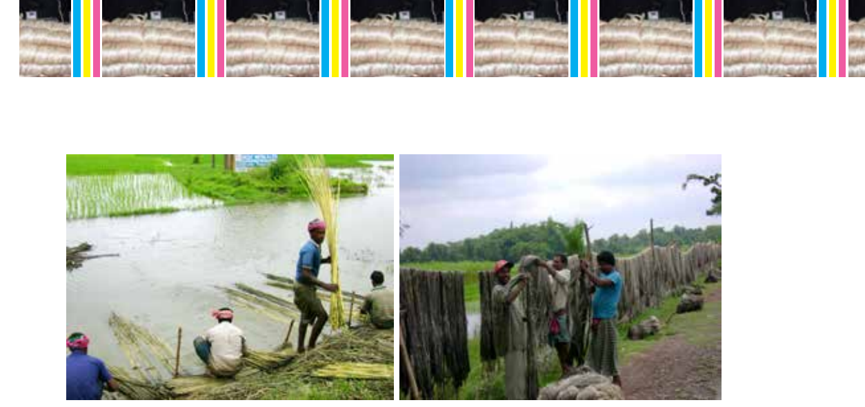
Plate 3. Fibre extraction and washing Plate 4. Drying of extracted fibre 3. Need for improved method of retting

The traditional method of retting requires a large volume of water (1:20:: Plant:water) for proper retting. There is a sharp decline in the permanent water bodies in jute growing areas during last 3 to 4 decades because of urbanization, siltation and creation of modern facilities and industrialization. The reduction in permanent water bodies reduced the scope of retting in good quality water with efficient retting microbes. Besides the decline in permanent water bodies, the irregular rainfall pattern during retting period aggravated the situation. The less rainfall during retting period for last few years in various jute growing areas of the country and West Bengal in particular has affected the jute farming. Under such a water scarce situation, retting following traditional method becomes a risky and non-profitable business. Sometimes farmers are compelled to ret their harvest in very low volume of muddy water resulting in very poor quality fibre and low net income.