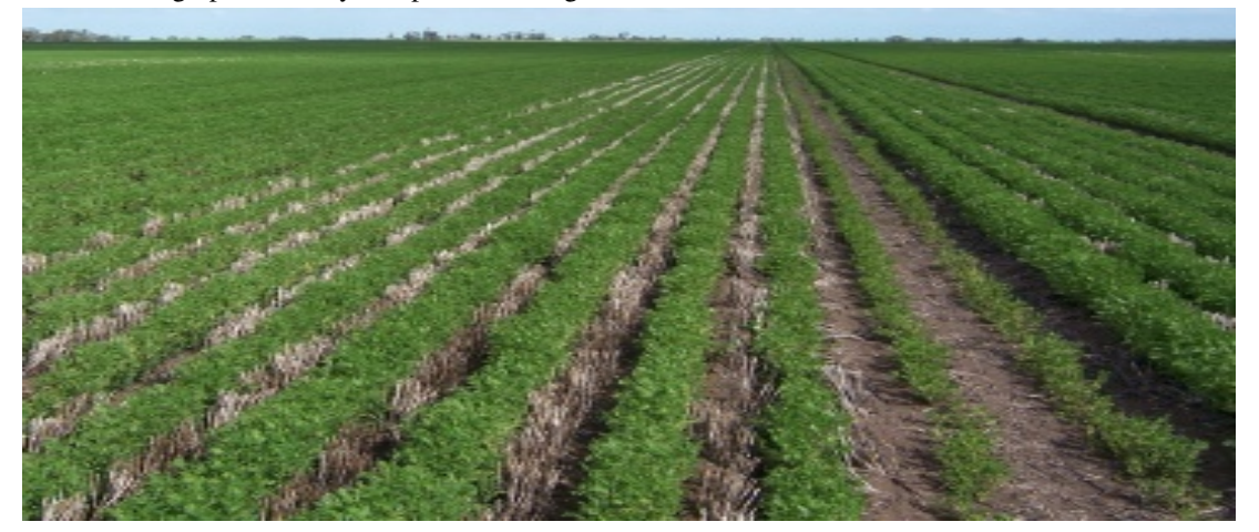
Fig. 3. Sowing of lentils between rows of cereal stubble helps to prevent lodging and improves harvest efficiency

Pulses fit very well into faming systems and crop rotations because of their disease control, weed control, soil fertility timelineness and financial benefits. They are a cash crop with important additional rotational and whole farm system benefits including fitting into grazing systems. Pulse fit well into modern farming system, particularly where minimal or no tillage farming is practised and where a cereal stubble retention system is in place. Erosion risks are minimal in pulse grown with no tillage and standing stubble situation. When pulse grown in rotation with cereals, they have advantage of providing an alternative income.