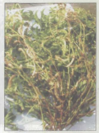
AK-1 (single plant)