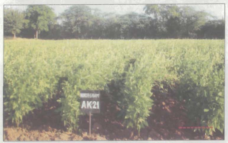
HORSEGRAM-AK-21 (field view)