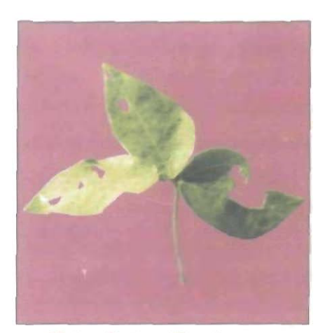
Hairy Catterpillar damage