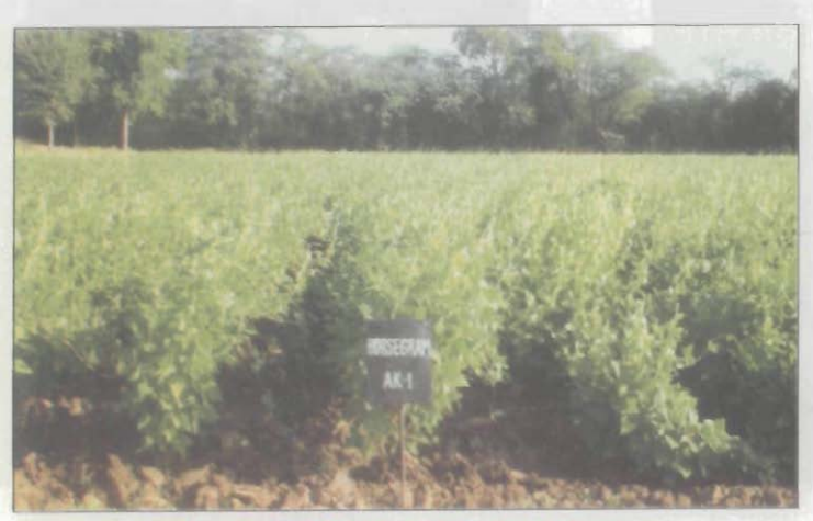
HORSEGRAM-AK-1 (field view)