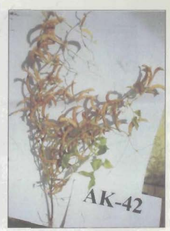
AK-42 (single plant)