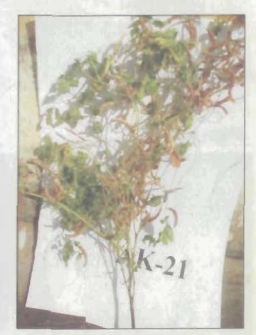
AK-21 (single plant)