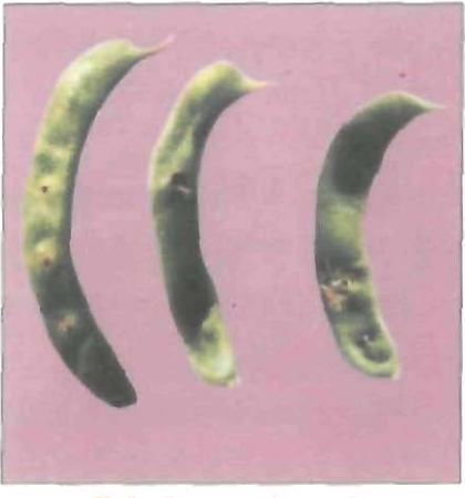
Poly damage in pods