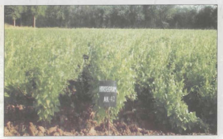
HORSEGRAM-AK-42 (field view)