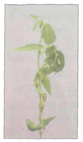
Spotted pod borer damage

Management : Remove and destroy the rolled leaves which contain different stages of the pest.