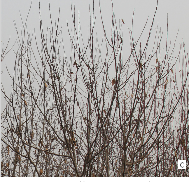
Figure 1: A: Morphology of fruit bearing branch of CITH-W-121; B and C: Showing difference in branching density and annual extension growth of dominant axis's in lateral (CITH-W-121) and terminal bearer (Sulaiman),