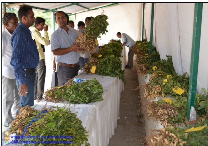
Groundnut plant materials exhibited by the farmers