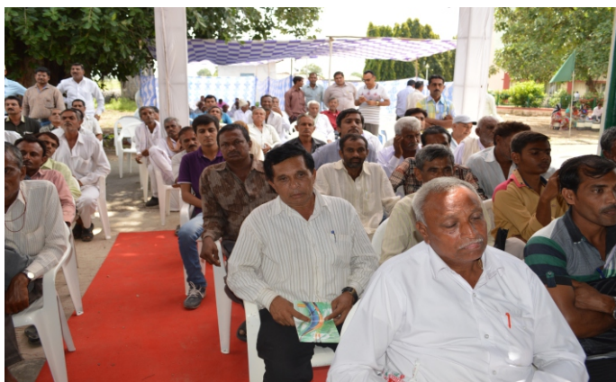
A view of the farmer audience