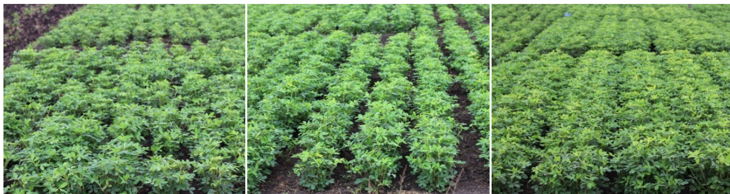
Groundnut crop sown at 30 x 10 (left), 45 x 10 (center) and 45/10 x 10 cm (right) spacing

Keeping in view above a field experiment was conducted during kharif 2015 and 2016 to identify suitable crop geometry for Spanish group groundnut variety TG 37A. Based on pooled results of two years it was found that paired sowing at 45/10x10 cm being at par with 30x10 cm spacing gave significantly higher pod yield over 45x10 cm spacing. While significantly higher haulm yield was obtained with 30x10 cm, 45/10x10 cm, 45/15x10 cm, and 45/20x20 cm spacing over 45x10 cm spacing. Besides, in paired cropping cost of production also comes down due to economical weeding through mechanical interculturing as compared to manual weeding in closer spacing of 30 x 10 cm spacing. Therefore, under late sown conditions of Spanish group varieties in black soils, paired sowing at 45/10 x 10 cm spacing may be promoted to get higher yield and reduce cost of cultivation as compared to closer sowing at 30 x 10 cm spacing.