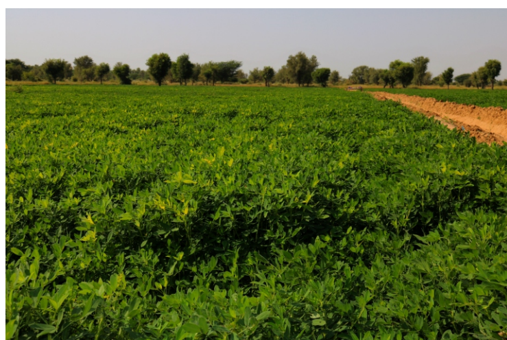
View of Seed Production Unit of ICAR-DGR at ARC, Bikaner