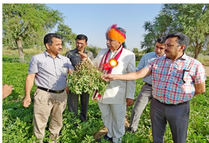
Shri Arjun R Meghwal, MOS for Finance with scientists at ARC, Bikaner