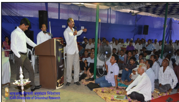
Farmers interactive session in progress