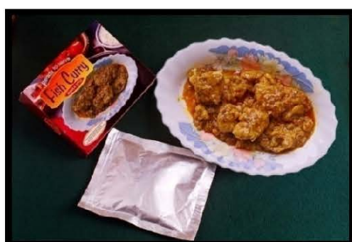
Fig.7. Fish curry in retortable pouches