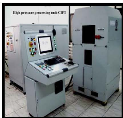
Fig.5. High pressure processing unit