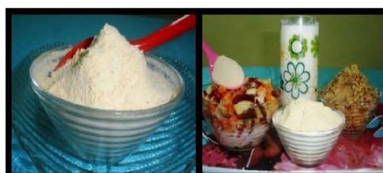
Fig.11. Collagen peptide from fish scale and Nutritional mix formulated by CIFT