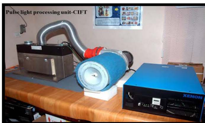
Fig.6. Pulse light processing unit