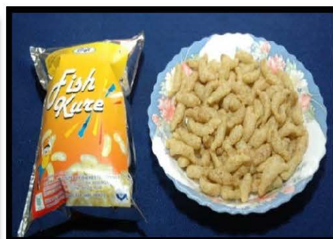
Fig.8. Extruded fish snack