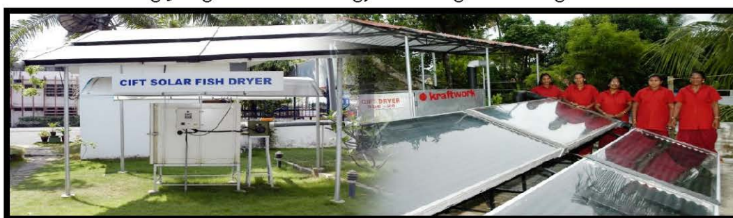
Fig.4. Solar dryer