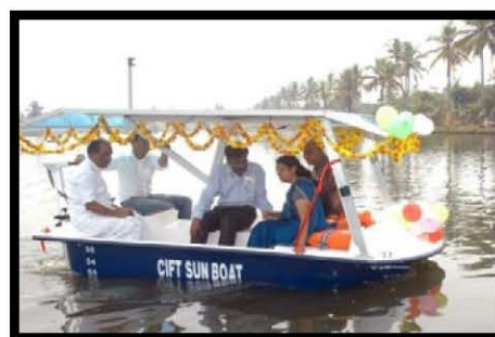
Fig.2. Solar-powered boat useful for aquaculture etc