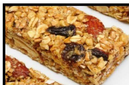
Fig. 10 Nutritional bar developed at ICAR-CIFT