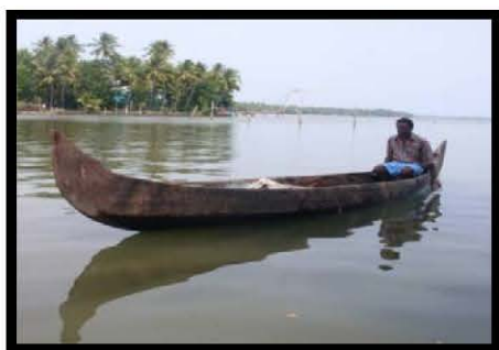
Fig.1. Rubber wood canoe

Fisheries is considered as a sunrise sector in India due to its recent renaissance and growth potential. The technological advancements in the harvest and post-harvest sector catalysed by the mechanization of fishing crafts and modern electronic technologies for navigation and fish location, along with energy efficient processing aids, offer good scope for the development of sector. Product diversification, promoting more public-private partnerships, creating more awareness on quality assurance throughout the value chain, taking initiatives for increased infrastructure facilities for market development, awareness creation on responsible and sustainable fishing practices etc. are crucial steps towards achieving 'blue revolution'.