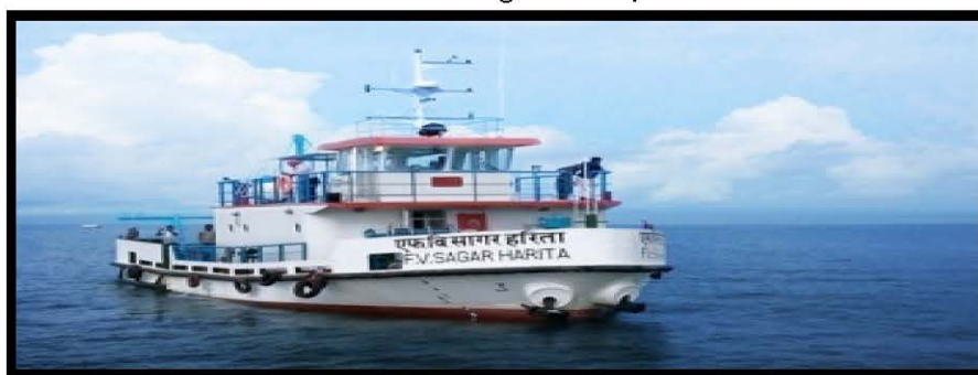
Fig.3. Sagar Haritha': Energy efficient green fishing vessel