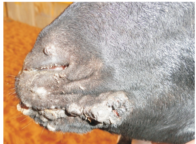
Plate 2. Phase II lesions of contagious ecthyma