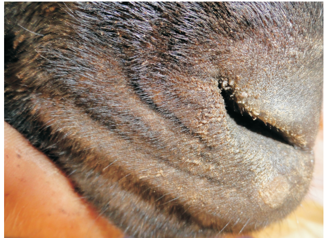
Plate 1. Phase I lesions of contagious ecthyma

attributed to a loss of viral infectivity during transportation/storage of the samples.