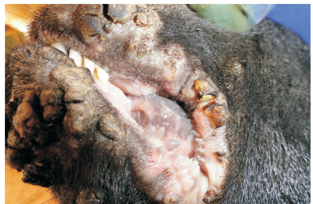
Plate 3. Phase III lesions contagious ecthyma