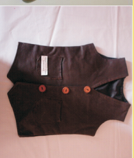
Mithun finished leather products (Jacket and ladies bag)