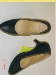
Mithun finished leather products (Shoe)