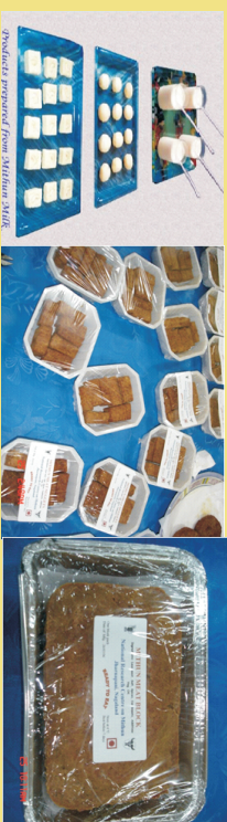
Mithun milk products (Lassi, rosgulla and barfi)

Finished leather products like bag leather, shoe upper leather, as well as garment leather were found to be soft and have better body and roundness and can be a better leather source for the leather industry.