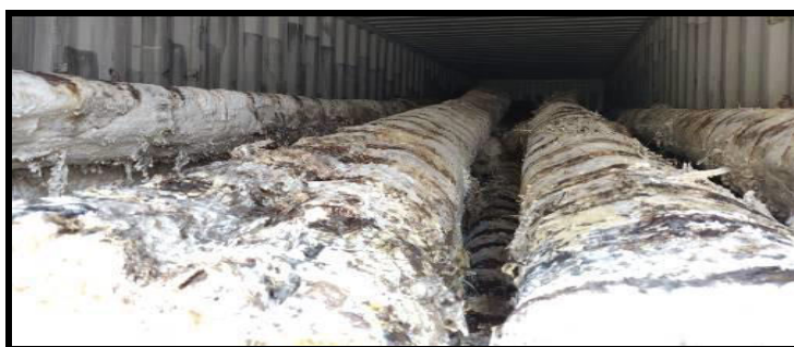
Fig.2a Fungal growth on wooden logs showing discoloration inside the container