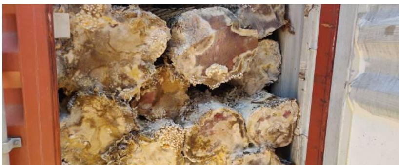
Fig.3b Luxurious fungal growth on timber logs covering core part of the wood logs