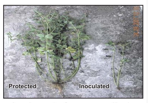
Reduced growth of Lagascea mollis due to Puccinia sp. (isolate NRCWSR-3) infection

Global climate change: It is expected that the growth of C_3 plants would be enhanced by CO_2 enrichment as compared to C_4 plants. The differential effect of CO_2 enrichment on C_3 and C_4 plants may have significant implications for crop weed interaction since majority of crops belongs to C_3 where as large number of weeds belongs to C_4 category. Therefore, it is very essential to undertake basic and strategic research including physiological, biochemical and molecular aspects to evolve fitting weed management technology.