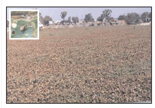
Biocontrol of water hyacinth

associated risk to change its behaviour and host specificity which may have to be looked into with great depth and vision.