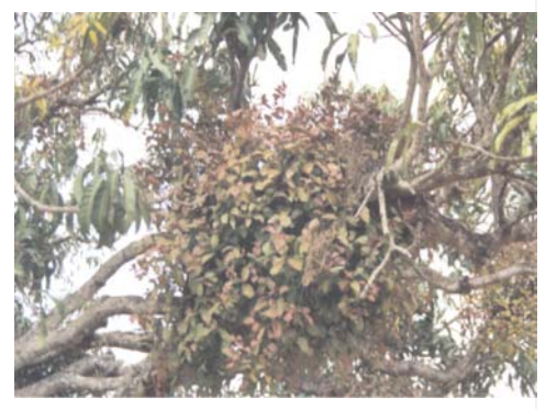
Loranthus attack on mango

(Kumar 2000) and in berseem, lentil, linseed and chickpea in parts of Madhya Pradesh. Some species of Cuscuta also infest ornamental plants, hedges and trees. Orobanche spp. is a major parasite in tobacco in parts of Karnataka, Andhra Pradesh, Tamil Nadu, and Gujarat, mustard in parts of Gujarat, western Uttar Pradesh, Rajasthan, Haryana, etc., and in tomato and potato in Karnataka. Striga sp.