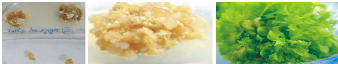
Fig. 4 : Effect of polyamine on enhanced embryogenesis over control.