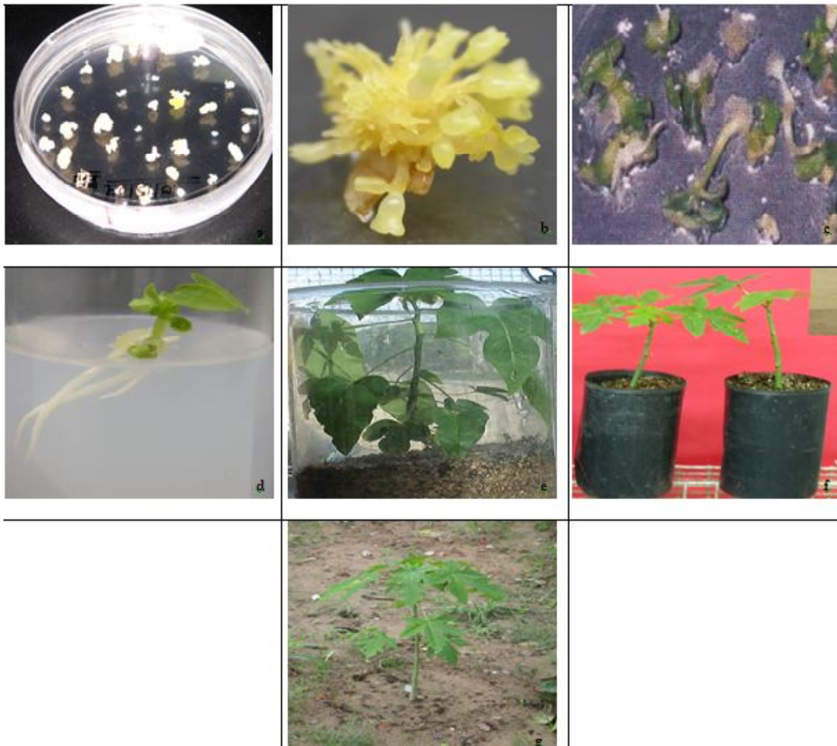
Fig. 1 : Somatic embryogenesis in papaya cv. Pusa Delicious: (a) Immature zygotic embryo, (b) Somatic embryo, (c) germination of embryos, (d) Rooting of shootlet, (e) Acclimatization of plantlets, (f) Acclimatized plants in poly bags and (g) Establishment of plants in field.

of embryos and embryonic clump was also significantly higher at this concentration (table 3). The results are in accordance with Fitch (1993) and Cai et al. (1999), who also found that 2,4-D at 10 \text{ mg l}^{-1} is prerequisite for embryo induction in papaya. The observations made during embryogenesis of papaya cv. Pusa Delicious revealed that 7-8 explants implanted on petriplate without dipping their radicle induced faster embryogenesis. The fused dicotyledons of embryos unfolded in 5-6 days and callusing started from the radicle. Within 3 weeks the explant was overlapped with callus forming a slimy layer of tissues beneath. Morphogenesis started from 4 th week leading to production of numerous threads-like yellowish-white structures called somatic embryos. The rate of formation of embryos increased when embryogenic calli cut into pieces and subcultured on fresh medium. The embryos emerging from the slimy growth of tissues beneath the