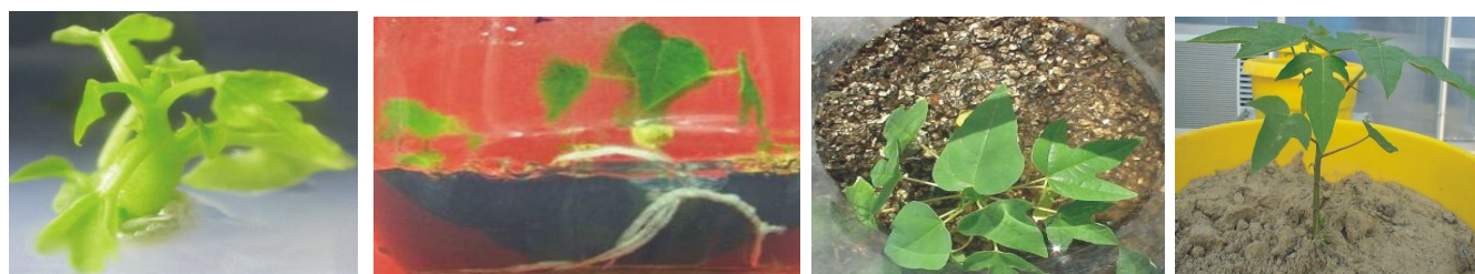
Fig. 6 : In vitro rhizogenesis in papaya: (a) Inoculation of 1-2 cm long in vitro shoot (b) Induction of primary root, (c) Fully developed roots of papaya in coco peat and (d) Acclimatized papaya plant in polyhouse.

1996 and Rajam et al. , 1998). PAs have never been used to augment regeneration frequency in papaya; as current study is the first report of the same. However, PAs have been reported as an important determinant for regulation of somatic embryogenesis (Minocha and Minocha, 1995, Minocha et al. , 1999 and Rajam et al. , 2004).