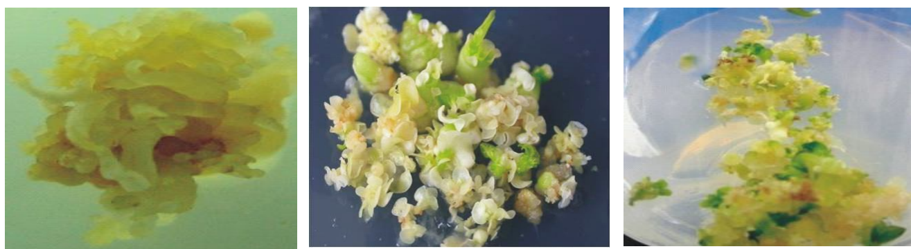
Fig. 5 : Somatic embryogenesis under the influence of PEG: (a) Somatic embryo, (b) Desiccated embryo and (c) Regenerating embryo.