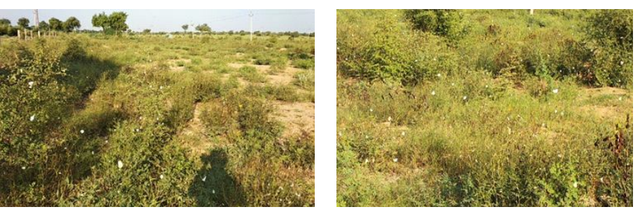
Fig 2: Butterflies flying in a senna field at Pokharan (Jaisalmer).

Table 3 depicts last 10 years rainfall data of Jaisalmer which revealed that during 2020 rainfall received in monsoon months (238.0 mm) and in particular September month (45.60 mm) is the highest in last One decade. All the arid districts received very good rains during September month. This may be one of the reasons of outbreak which favored either the multiplication of pest or increased the foliage of the plants. Thus, caterpillars received the more amount of palatable food. Richard et al. (2017) found positive