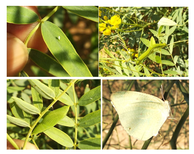
Fig 3: 3a. Egg, 3b. Larva, 3c. Pupa, 3d. Adult.

association between precipitation and caterpillar abundance of Platyprepia virginalis . Synchrony with host plant has been suggested as an important factor in the dynamics of many forest pests (Van Asch and Visser, 2007). For instance, 69% of Rhopobota naevana neonates die before feeding when presented with only old cranberry leaves compared to 11% on young expanding foliage. Population growth is thus five times higher if larvae hatch in synchrony with host bud burst (Cockfield and Mahr, 1993). First-instar Zeiraphera