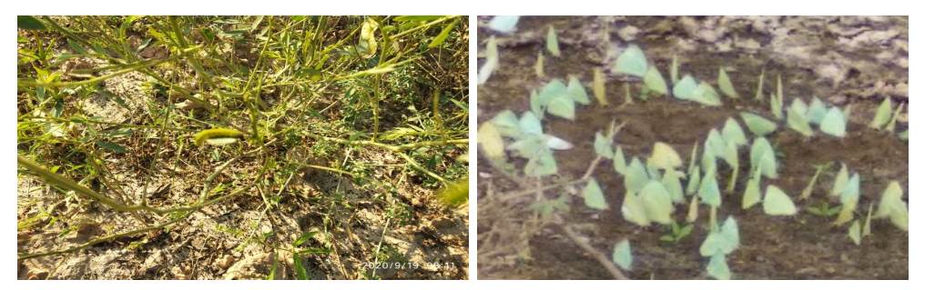
Fig 4: 4a Defoliated senna plant 4b Adult butterflies imbibing nutrients from moist soil.