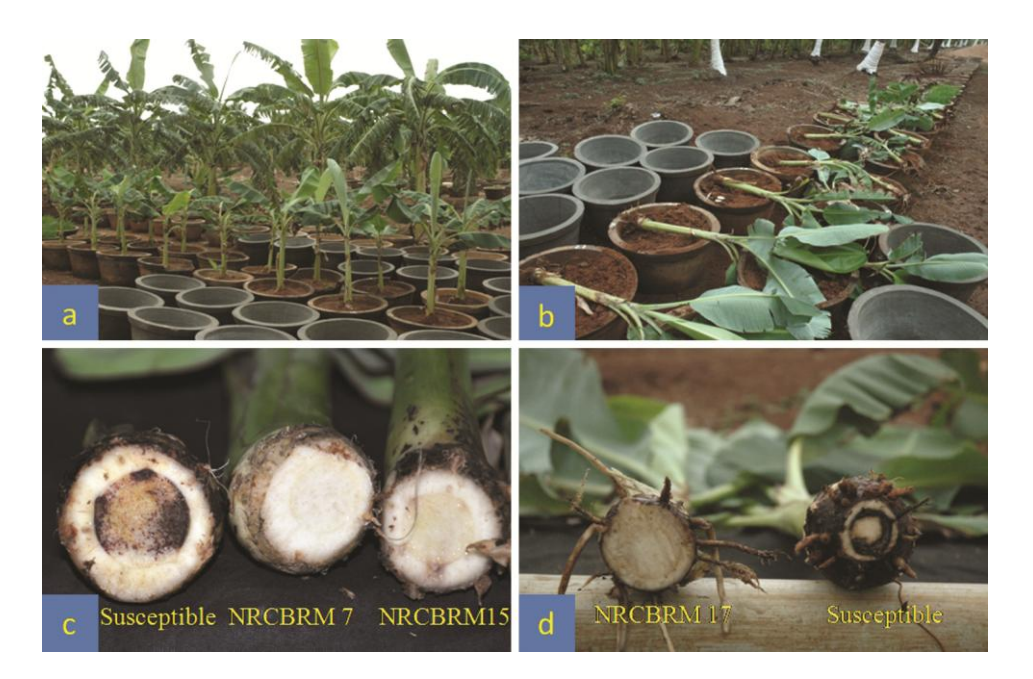
Fig. 3—(a) Challenging with spores of Foc race1 @ 30g/pot; (b) Disease scoring after 6 months of inoculation; (c) Resistant mutants of Rasthali (NRCBRM 5& 15) with the susceptible mutant; and (d) Resistant (NRCBRM 17) mutant of Rasthali with the susceptible mutant.