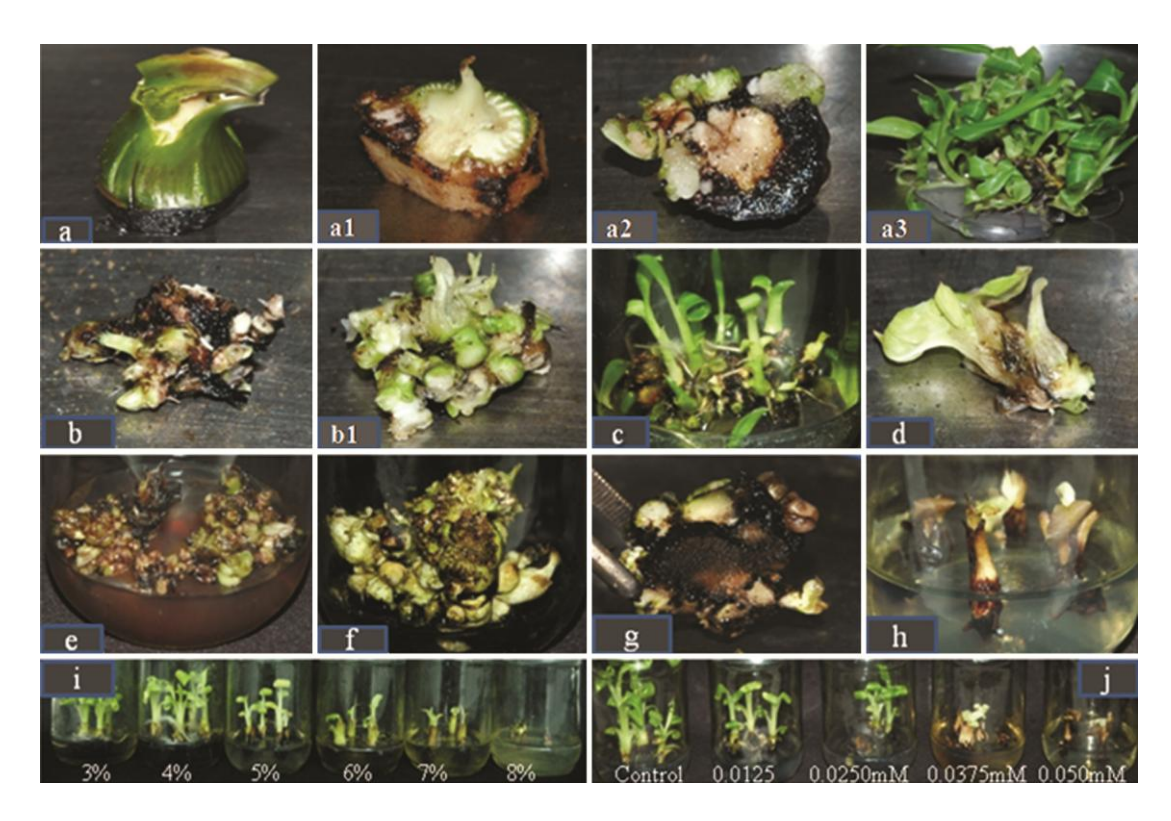
Fig. 4—Establishment of shoot tips and proliferating buds during in vitro mutagenesis and screening. [(Panel a): Chemical mutagen treated shoot tip after 3 wk of initiation; (Panel a1): Shoot tip after 4 wk of initiation; (Panel a2): Shoot tip after 8 wk of initiation; (Panel a3): Proliferating shoots after 16 wk of initiation; (Panel b): Chemical mutagen tre; (Panel d): Shoot abnormality (variant) encountered during chemical mutagenesis; (Panel e): Chemically mutated proliferating bud showing browning at supra-optimal concentration; (Panel f): Shoot buds showing abnormality at higher concentration of NaN<sub>3</sub>;. (Panel g, h): Dried and decayed proliferating buds and shoots at higher concentrations of toxins in the culture media; and (Panel i, j): Effect of varied concentrations of culture filtrate and fusaric acid on the survival and growth of proliferating shoots]

higher concentrations of fusaric acid (0.09 mM) and culture filtrate (9%). This could be attributed to the induced excess secretion of phenols due to the stress imposed at higher concentrations of toxins. Release of excess phenols due to toxins normally leads to the browning of media and subsequent inhibition of growth of proliferating shoots<sup>44</sup>.