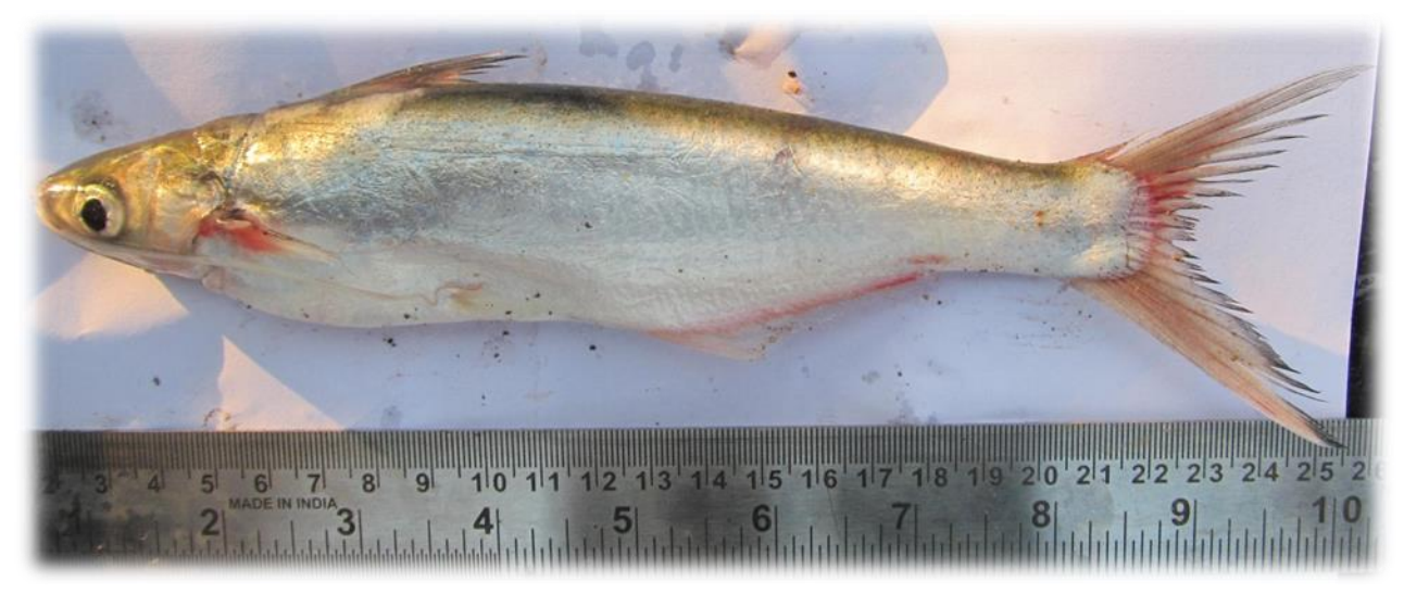
Fig. 1. A fully matured C. garua collected from a large reservoir resources

Maximum length : 60.9 cm of SL (Shrestha, 1990) and 100 cm of TL (Talwar and Jhingran, 1999).