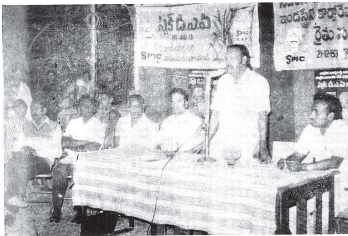
'Rythu Sadassu' at Murari.