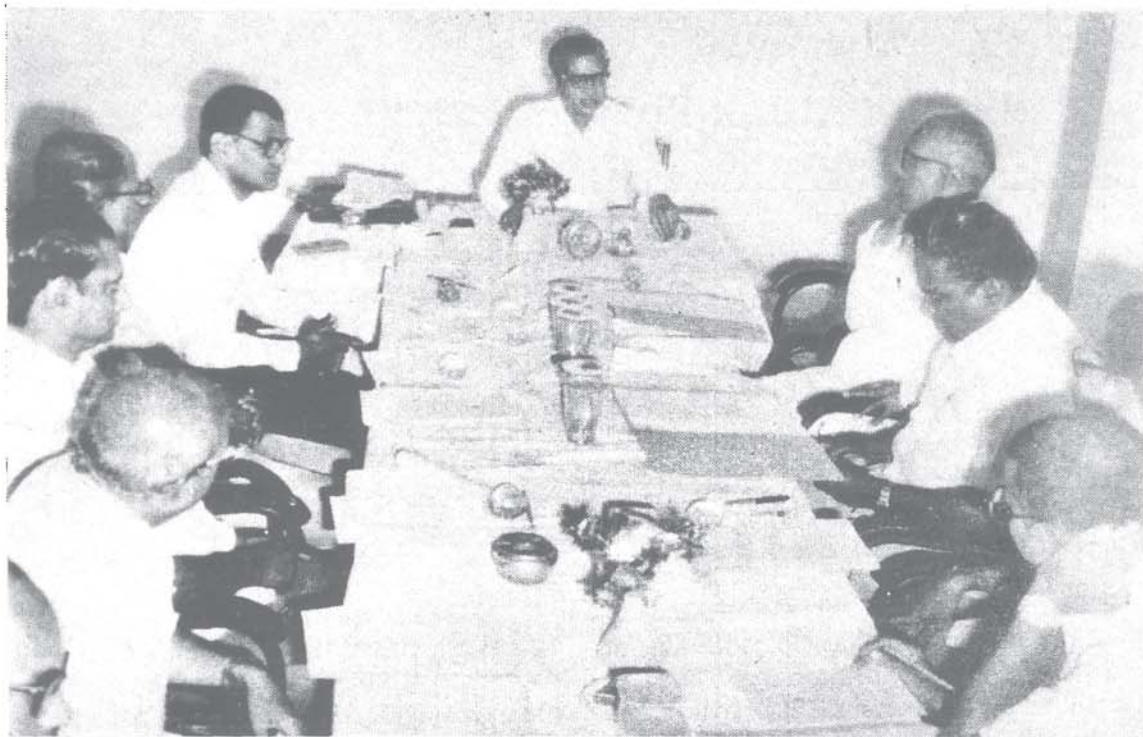
Management Committee meeting held at CTRI Research Station, Guntur