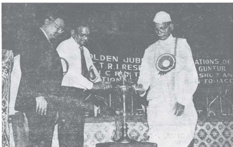
Prof. N. G. Ranga inaugurating the Golden Jubilee Celebrations.