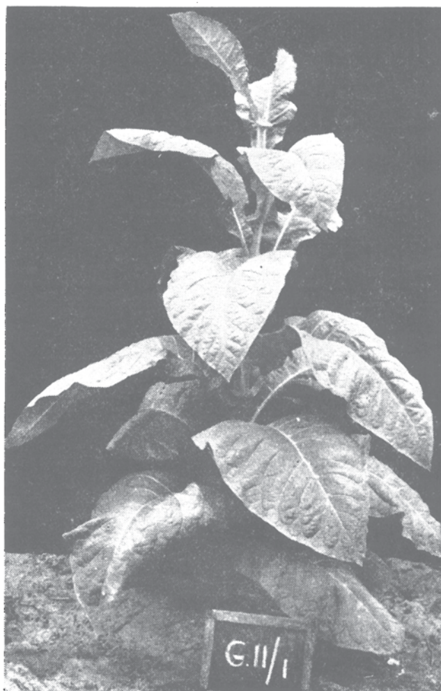
Newly released variety. HEMA

The newly developed fcv tobacco variety HEMA has been released for cultivation in black soils of Andhra Pradesh by the Central Sub-Committee on crop standards at its 12th meeting held on 13th Feb., 1989 in New Delhi.