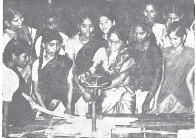
Trainees with Palmyrah leaf cutting machine.