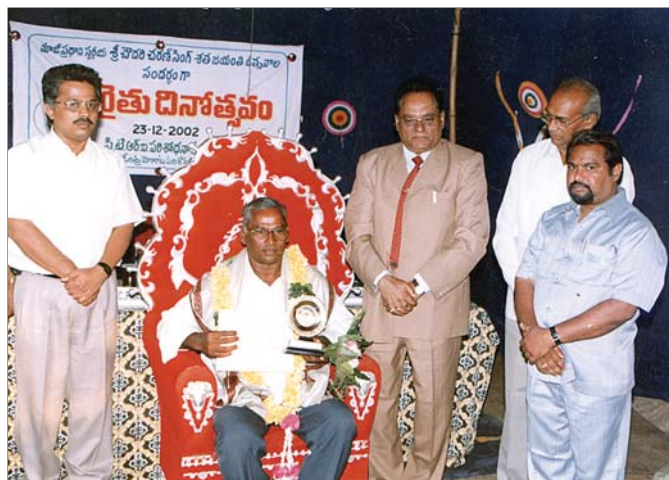
Felicitation of NLS progressive farmer

Farmer's week was conducted from 17.12.02 to 22.12.02. On the first day, farmers were explained about methods of tobacco cultivation, intercropping system in Motihari tobacco, varieties developed and plant protection measures. Kisan Divas was organized on 23.12.02. Ten progressive tobacco farmers from different Motihari & Jati growing areas of Dinhata were felicitated for getting higher yields by adopting recommended production technologies.